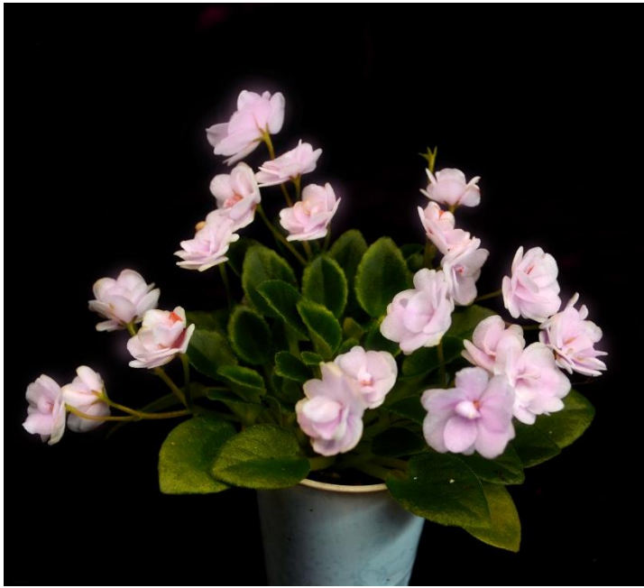
Andy's Saintpaulia 'Hunter's Chickadee'