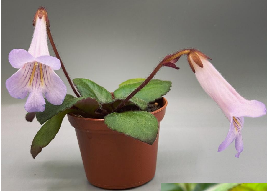
Primulina 'MB Dark and Stormy' @millennialplantdr