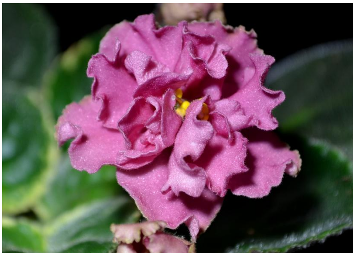
Andy's Saintpaulia 'Ness' Orange Pekoe Standard