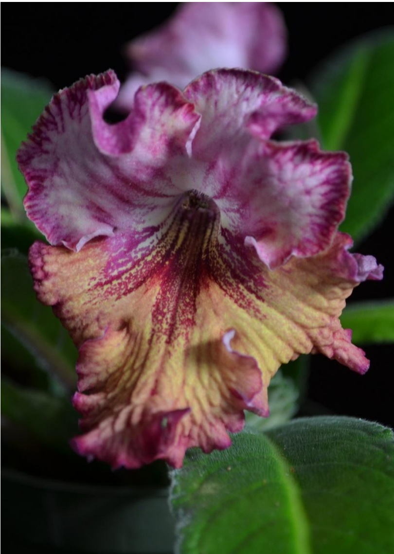
Andy's Streptocarpus 'Listy'

From Church personnel: Please use the Youth Room on our upper level for your meetings until further notice. I'm not sure when the water damage repairs will be completed in Room 3, but will let you know. There will, of course, be no extra charge for using the different space!