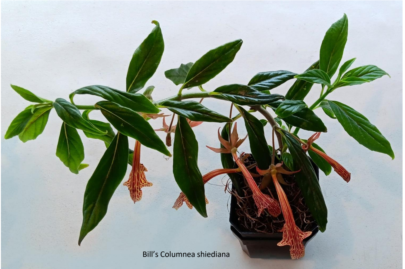
Bill's Columnea shiediana