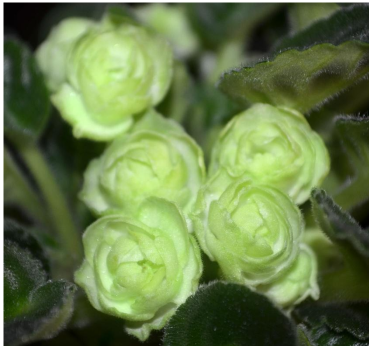
Andy's Saintpaulia 'Hunter's Cabbage Goddess' Miniature