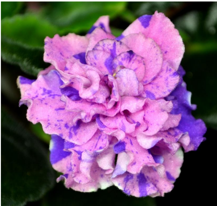
Andy's Saintpaulia 'LE-Rosmari' Standard Russian