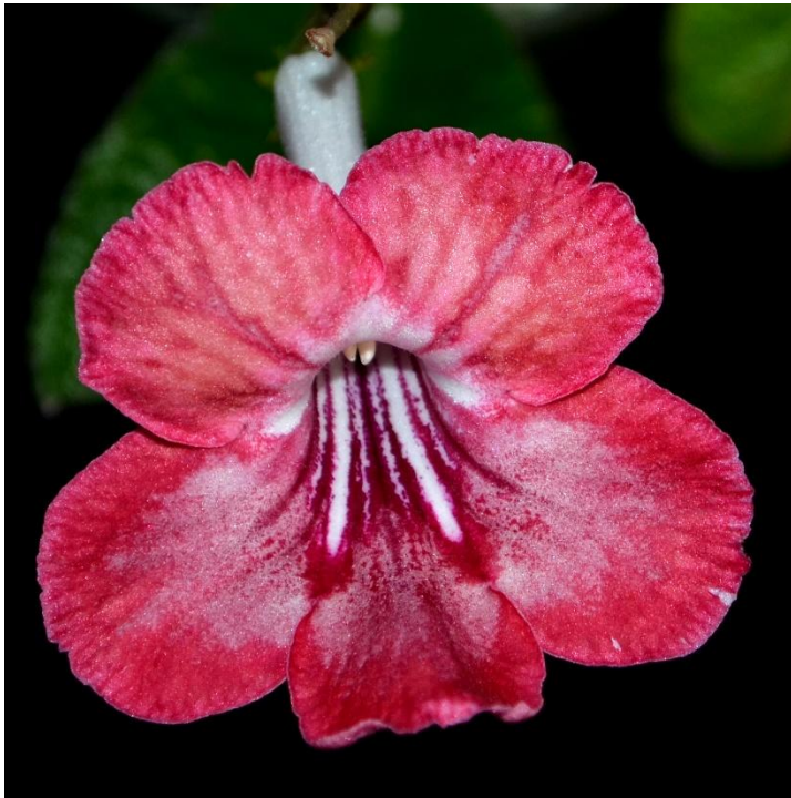
Andy's Streptocarpus 'True Passion'