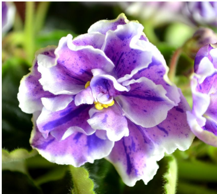
Andy's Saintpaulia 'AE-It's Raining' Standard Russian