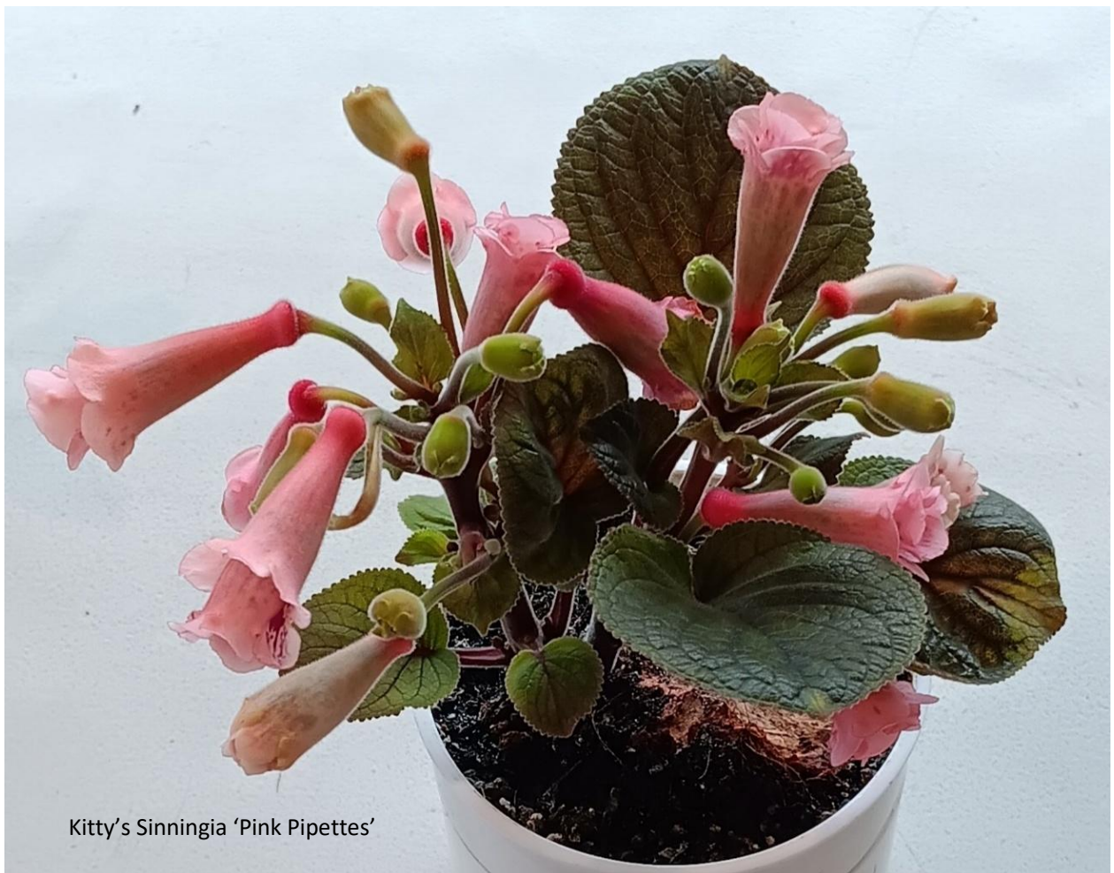
Kitty's Sinningia 'Pink Pipettes'