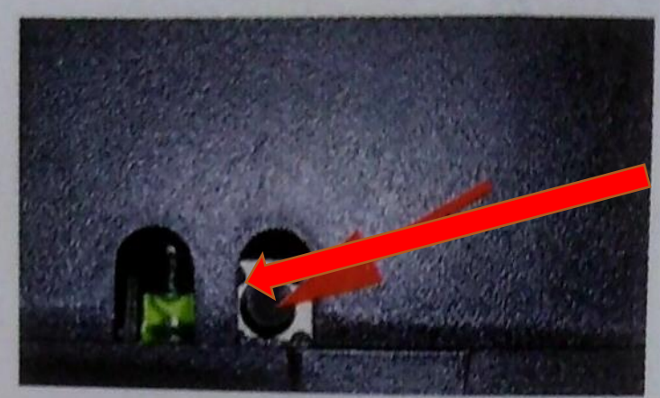
button is inside control box on side of receiver

a) Press the button three times, the LED stays solid green