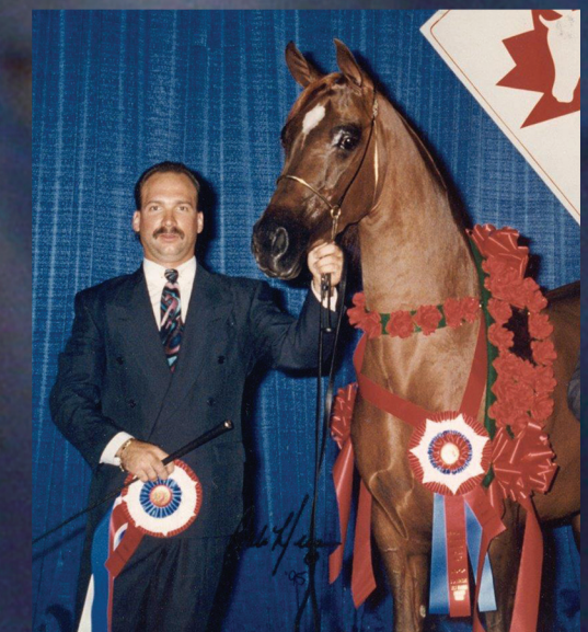
Top Left: Out Til Midnight, 3-time National Top Ten and sire of 10 National Winners Top Right: ROL Intencyt, Canadian National Champion Futurity and sire of 13 National Winners Lower Left: O Whata Cyte+, National Champion and 5-time Top Ten Lower Center: ROL Red Roses, Canadian National Champion HA Yearling Filly and Reserve National Champion HA Futurity Filly Lower Right: Cymply Red, Canadian National Champion Futurity Filly and dam of 6 National Champions or Reserves