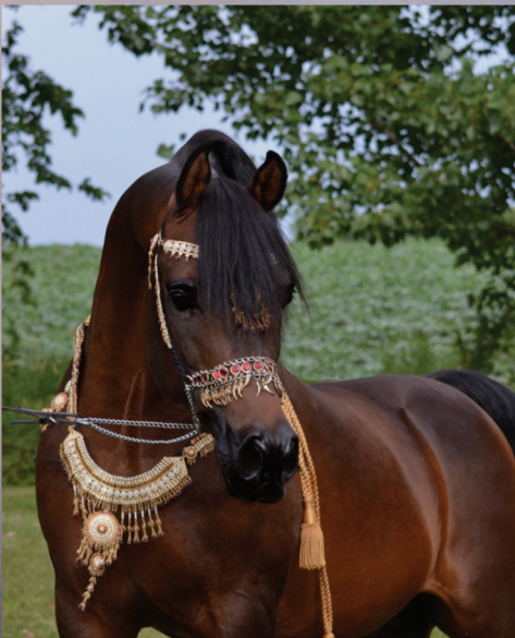
Top Left: Cytosk+++/, U.S. Reserve National Champion English Pleasure; 4-time National Top Ten in Halter & Performance Center Right: Out Of Cyte, Class A Champion Stallion & Regional Champion Lower Left: First Cyte+, 3-time U.S. & Canadian National Champion Halter; 2-time Reserve National Champion