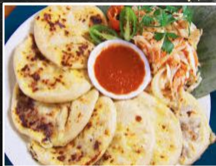
PUPUSAS $2.5 EACH