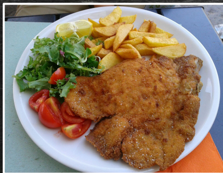
CHICKEN OR BEEF MILANESA $9.99