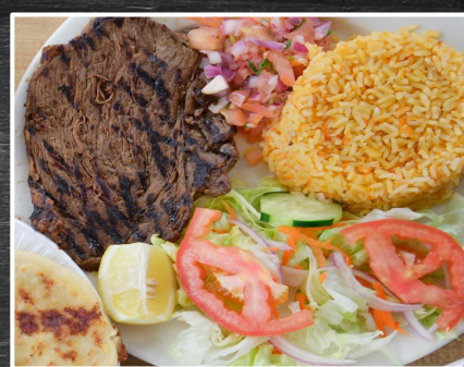
CARNE ASADA $9.99