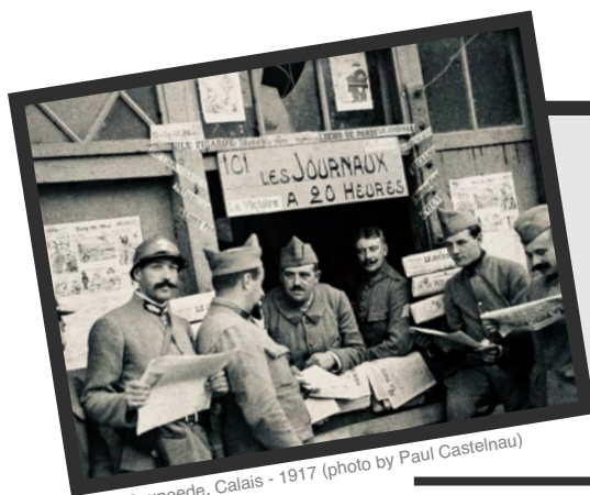
Rexpoede, Calais - 1917