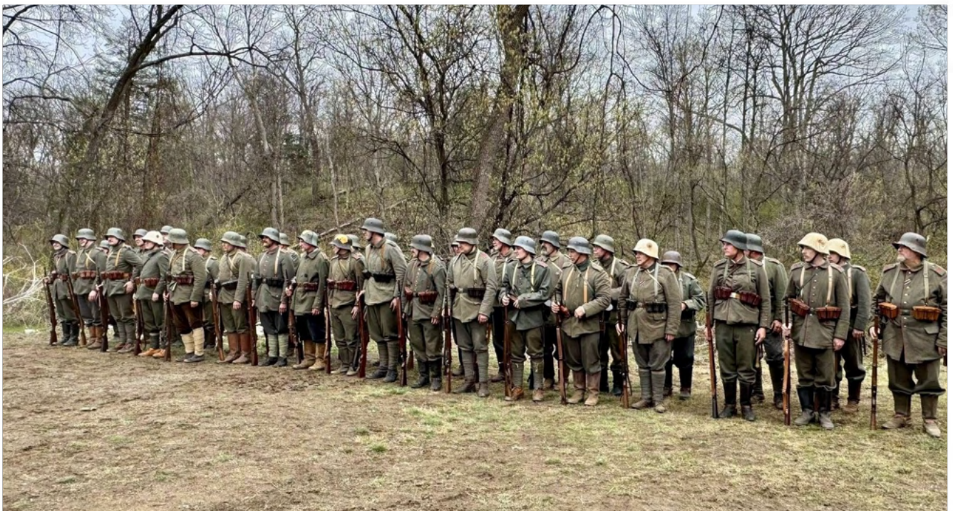
4th Zug CP Forces, April 2025