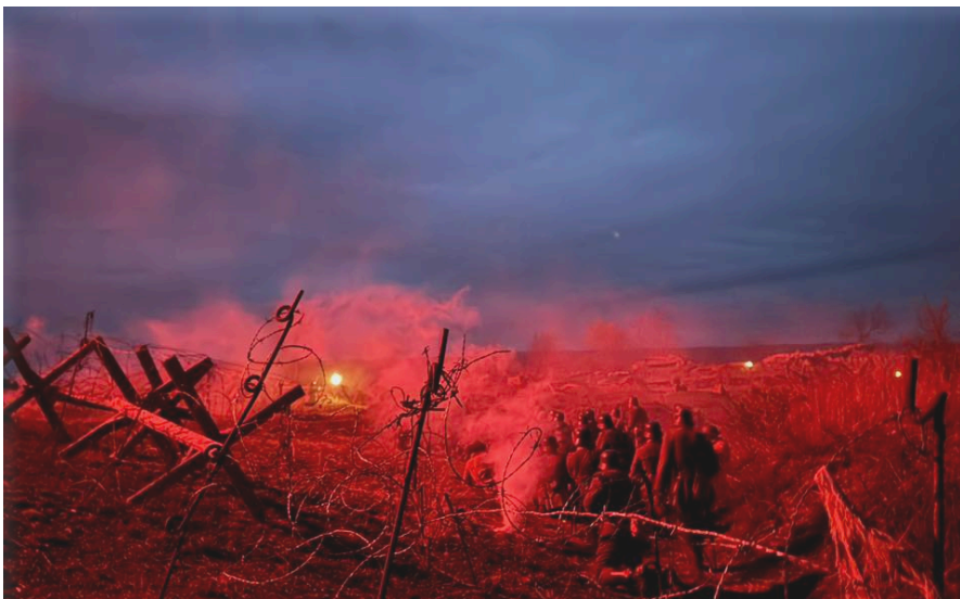
Night Attack Over IR92's Sector.

Let me first talk about improving the site. The site needs a twenty-year site plan, to include existing infrastructure, areas of annual maintenance, and the proposed trench line, structures and improvements for the next 1, 3, 5, 20 and 20 years. This effort will require a renewed effort by a joint (CP and Entente) Site Committee.