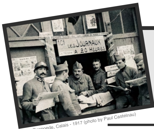
Rexpoede, Calais - 1917