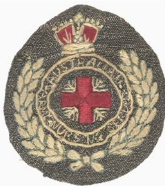
AANS Embroidered Sleeve Badge

An ankle length grey serge dress with a long sleeved, loose fitting blouson bodice, a six gore skirt and a self fabric belt. The bodice had a yoke at the back but not at the front. This was fastened with 5 buttons (in front) from the neck to the waist and the belt had two buttons. The stand collar and cuffs were edged with narrow, linen liners. On the right sleeve, just above the elbow there was a raised embroidered AANS Badge. A silver version of the Australian "Rising Sun" Collar badge was worn at the throat of the dress. The buttons were the raised Australia map buttons in