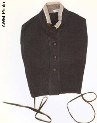
Dickey front for the 1916 Dress

On the 1916 Outdoor Jacket the shoulder straps were most commonly detachable and chocolate colored. On some photos the shoulder straps are clearly grey. This may indicate the rank of Staff Nurse versus a Sister or Matron. More research in this area is needed.