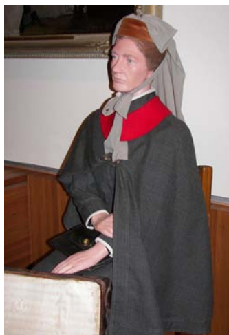
1914 Outdoor Dress with Grey Serge Cape and Early War Bonnet