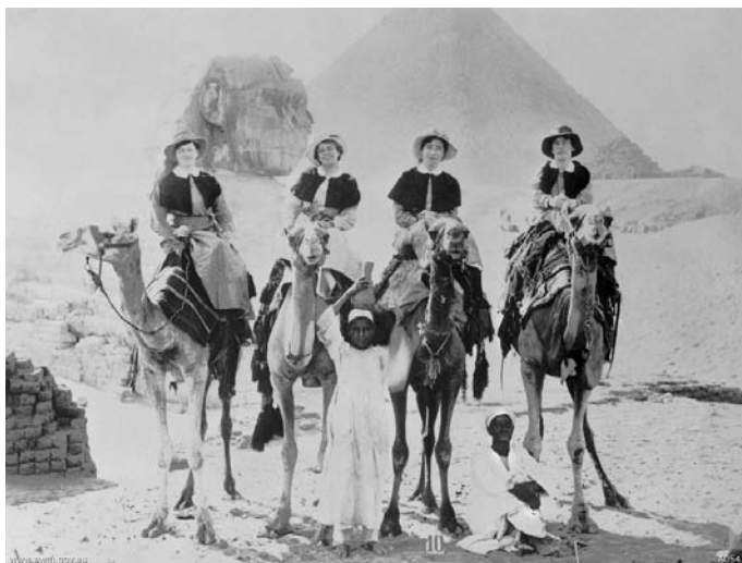
Cotton Working Dresses used as an outdoor dress in Egypt. Notice the variety of headgear.