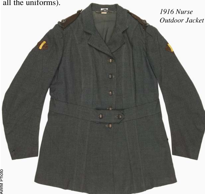
1916 Nurse Outdoor Jacket

In 1916 the AANS Outdoor Dress was changed and army officer's rank was given to all nurses. The outdoor uniform itself changed to a grey serge suit consisting of a Norfolk jacket and a 5 gore skirt. Oxidized rank insignia and "AUSTRALIA" titles were worn on the shoulder straps of the jacket. Army unit color patches were worn on the upper sleeves. In working dress rank insignia was worn on shoulder straps of the red cape. Nurses who served in the forward hospitals on Lemnos during the Gallipoli campaign were awarded the Anzac "A" like other AIF veterans of the Dardanelles (This was one thing the mini-series ANZACS got wrong on the uniform. The nurse, Kate Baker should have been wearing an "A" on her shoulders. Other than that they did a great job on all the uniforms).