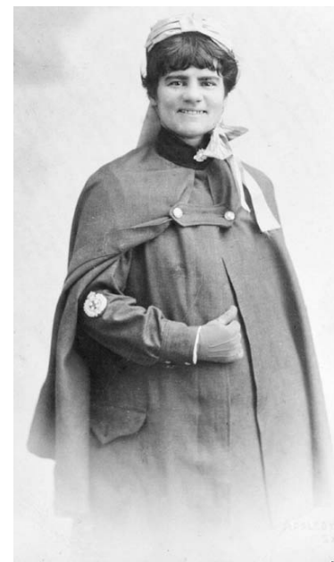
Grey Serge Cloak

The 1914 Outdoor Dress could be converted into a mess dress by wearing a scarlet shoulder cape (see Working Dress below) fastened with a silver "Rising Sun" badge over the dress, and a white silk raised cap and veil. Photographs I have seen also indicate that the cotton working dress, with scarlet cape and without the white apron was used as an outdoor dress in hot climates.