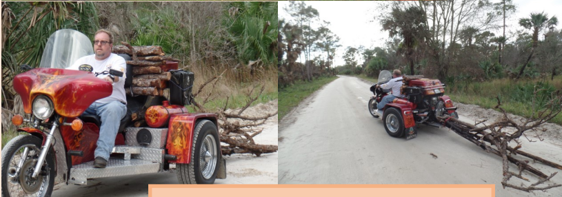
The trike makes an excellent wood hauler!