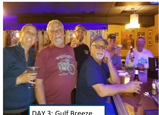
DAY 3: Gulf Breeze