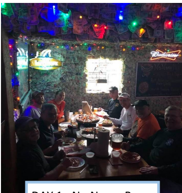
DAY 1: No Name Bar