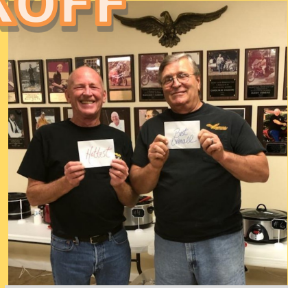
HOTTEST & BEST OVERALL