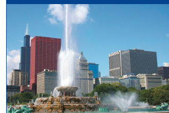
Guided Tour of Chicago