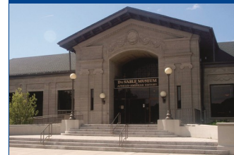
Explore the DuSable Museum of African American History

Departure: VFW Post 4706, 5362 Covington HWY, Decatur, GA @ 8 am