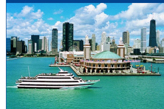
Enjoy a Skyline Cruise on Lake Michigan