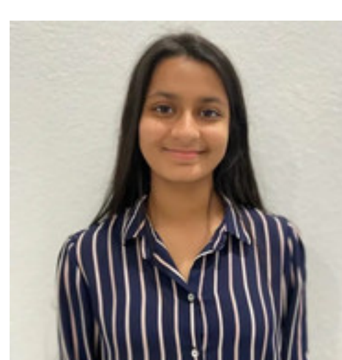
Community Outreach Manager