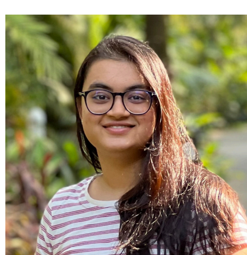
Social Media Manager