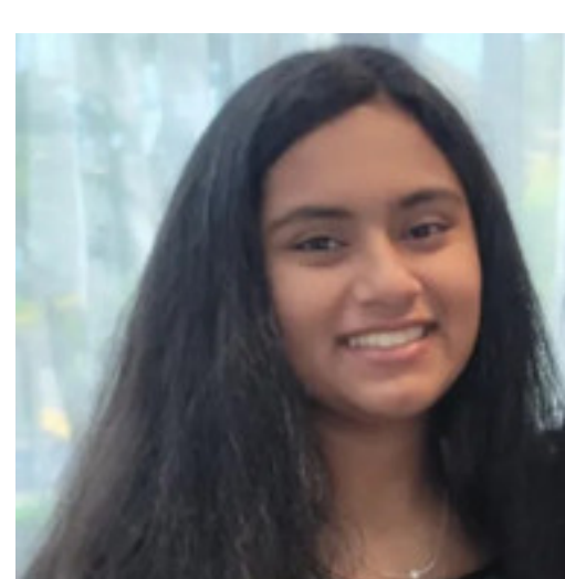
Volunteer Recruitment Manager