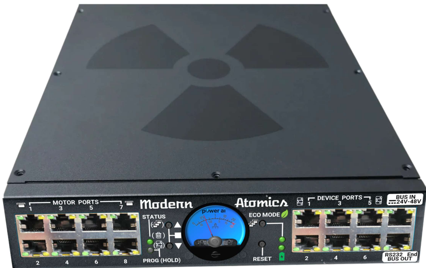
Reaktor's built-in Ammeter shows how much quiescent current is being saved in real-time.

Leveraging patent-pending technology developed by the company, Reaktor is the first PDU designed solely for motorized shades, powering up to 22 where others max at 8. Reaktor eliminates up to 99.75% of all the quiescent current*, saving up to 412 Kilowatt-hours yearly, and its built-in Ammeter shows how much current is being saved in real-time. Reaktor is compatible with low-voltage DC, and high-voltage AC motors, and works with popular shade and control brands. Requiring no conduit or electrician, and wall or rack-mountable, Reaktor saves installation space and cuts install time and costs by 50%. Reaktor began shipping this month. MSRP is set at $1,499. Specs: https://modernatomics.com/reaktor