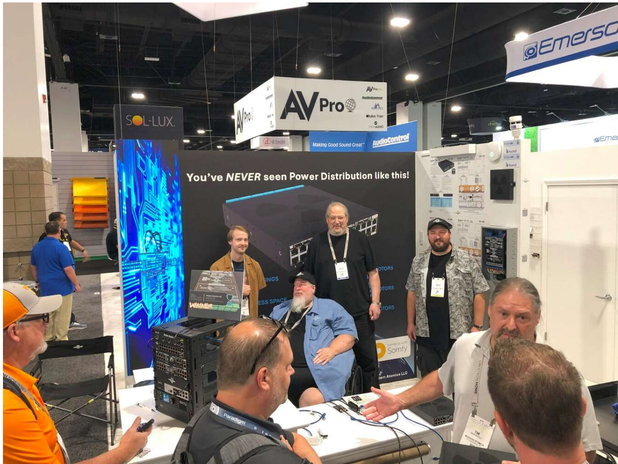
The Modern Atomics Team at CEDIA Expo

Founded in 2024 and headquartered in Austin, TX and with offices in Singapore, Modern Atomics' mission is to bring innovative technology to the CEDIA and ProAV channels that provide higher value, lower deployment costs, reduce the carbon footprint of every project, and delight customers with experiences not possible from any other product or company at any price. Modern Atomics holds several patents in Ai-based power, control, and distributed a/v products. The company's first product, Reaktor, utilizes patented technology developed by Modern Atomics. For more information visit www.modernatomics.com