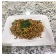
(L27) Pan Fried Bamboo Shoots