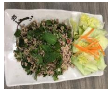
(L28) Beef Laab