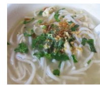
(L29) Kao Piak Sen