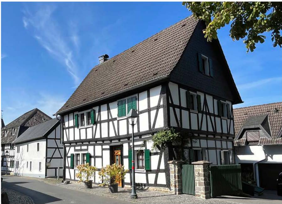
Haus Hambitzer in Stadt Blankenberg, the oldest house in the town. The year 1697 is carved in the wooden beam above the entrance.

In 1946, the Rhine Province was divided to form the German states of North Rhine-Westphalia and Rhineland-Palatinate, with Blankenberg falling in the territory of the former. In 1954, Blankenberg’s name was officially changed to Stadt Blankenberg to recognize its former status as an independent city, though it is still considered a part of the city of Hennef. In 1987, Stadt Blankenberg was placed under “protected monument” status, and the restoration of its historic structures has been ongoing since then.