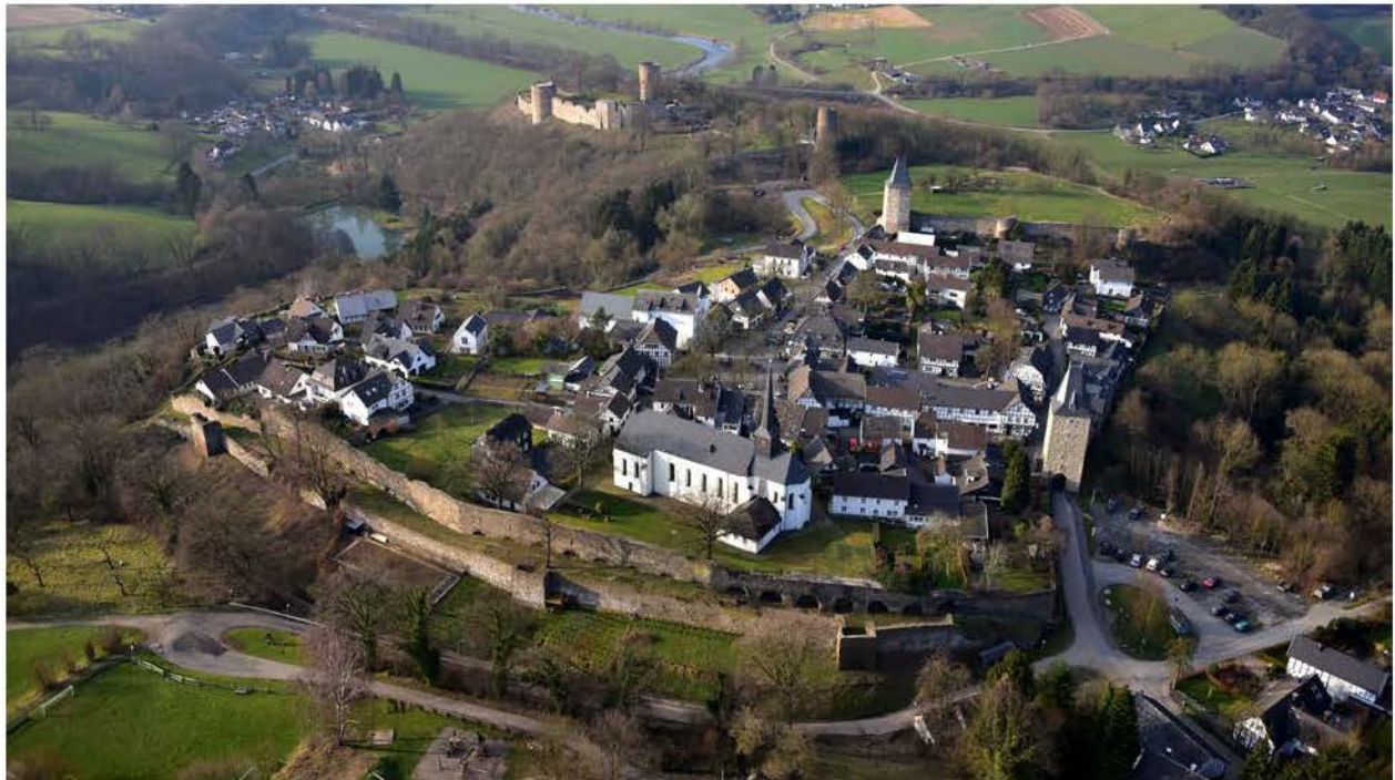
Aerial view of Stadt Blankenberg (Hennef) and Burg Blankenberg (top center of photo).