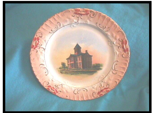
Commemorative plate with image of 1892 Zuschka School