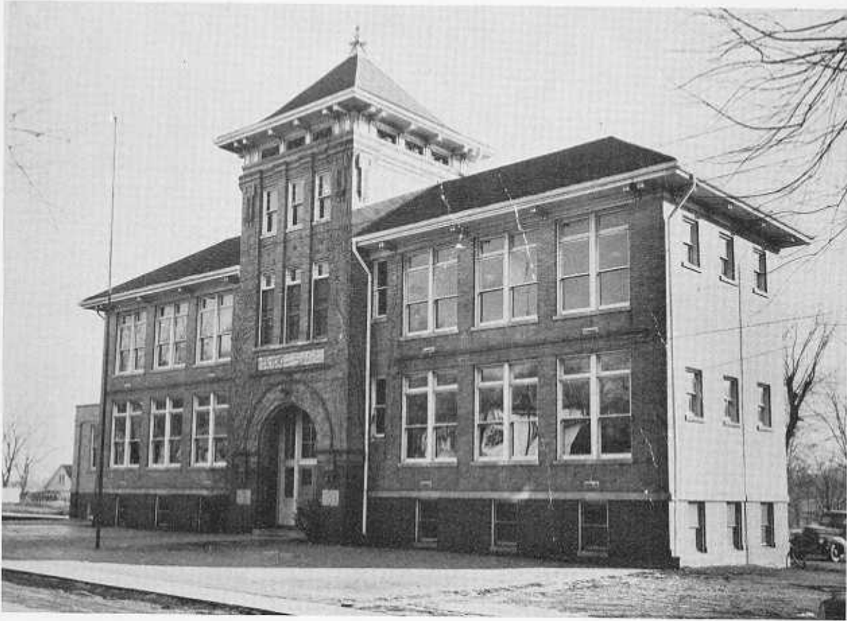
Zuschka School built in 1909