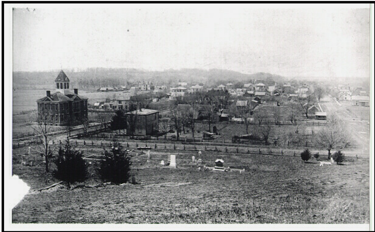
Arenzville in 1900, as viewed from near John Zuschka's resting place in the East Cemetery.