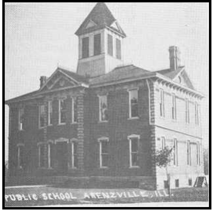
1892 Zuschka School