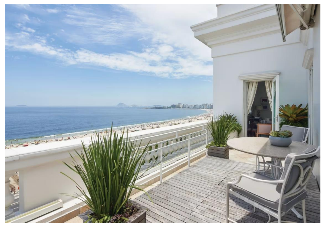
Copacabana Palace, A Belmond Hotel, Rio de Janeiro Seven Bedroom Penthouse Suite

Milan: Visit the stunning Duomo di Milano, enjoy shopping at high-end boutiques and savor a private dinner at a Michelin-starred restaurant with views of the city.