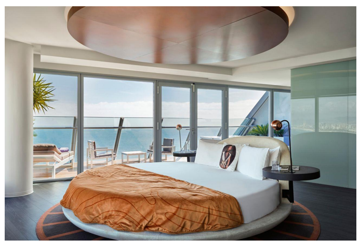
W Barcelona WOW Suite

Zurich: Take a scenic boat ride on Lake Zurich, explore the charming old town and enjoy fine dining in your penthouse with stunning views of the Alps.