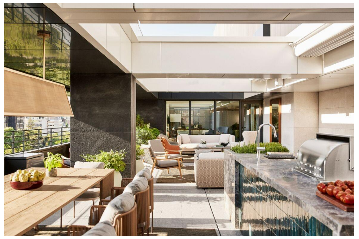
Rosewood Villa Magna Royal Anglada House

Madrid: Explore the art treasures at the Prado Museum, indulge in tapas at a private culinary tour and enjoy dinner in your penthouse with views of the Royal Palace.