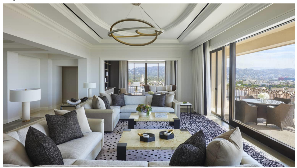
Beverly Wilshire, A Four Seasons Hotel Penthouse Suite

Los Angeles: Explore the Hollywood Hills, visit famous landmarks like the Walk of Fame and enjoy a private dining experience in your penthouse overlooking the city.