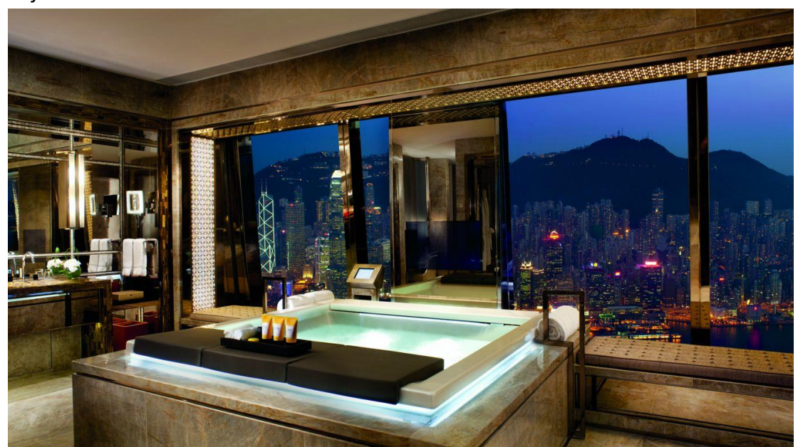
The Ritz-Carlton Suite, Hong Kong

Hong Kong: Explore the vibrant streets of Central, enjoy dim sum at a private dining room then relax with cocktails in your penthouse while gazing at the iconic skyline.