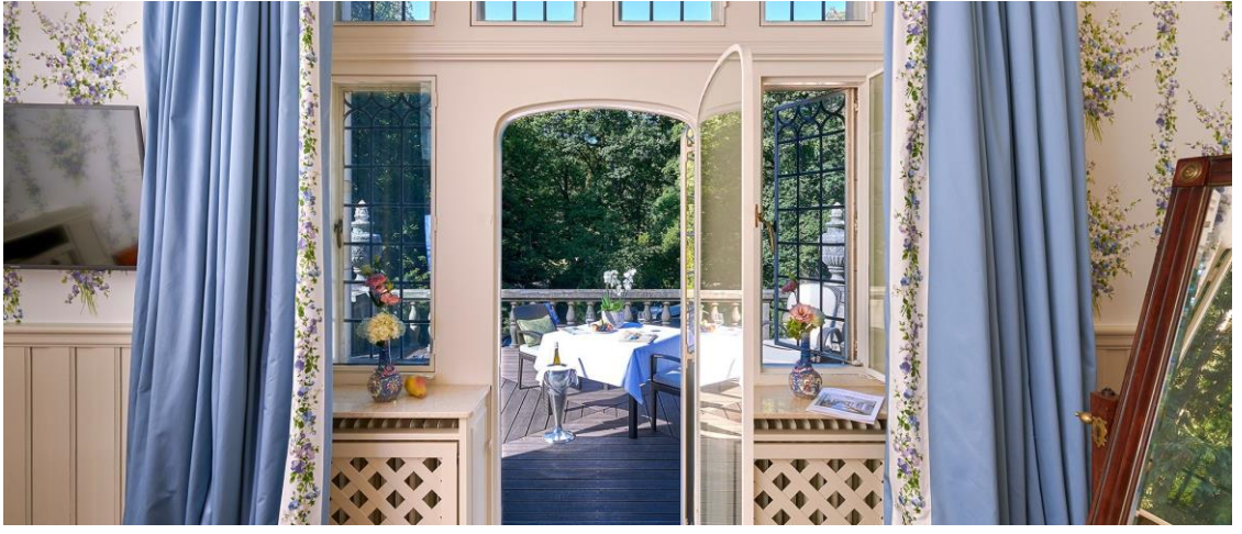
Schlosshotel Kronberg Castle Balcony Suite

• Frankfurt : Explore the Römer, visit art galleries and enjoy a luxurious dinner in your penthouse with skyline views.