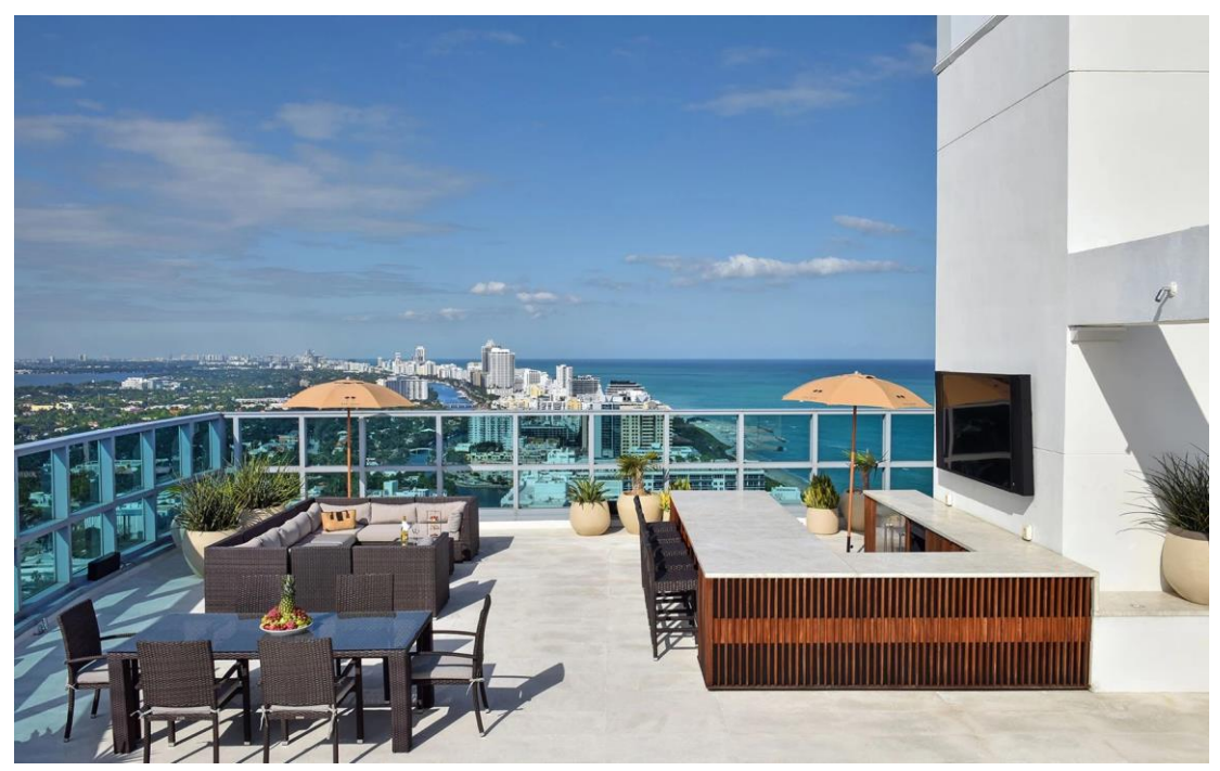
The Setai, Miami Beach The Penthouse Suite

Los Angeles: Explore the Hollywood Hills, visit famous landmarks like the Walk of Fame and enjoy a private dining experience in your penthouse overlooking the city.