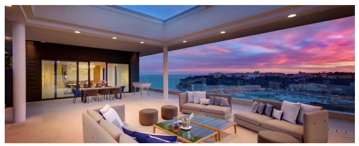
Hôtel de Paris Monte-Carlo Diamond Suite - Princess Grace

Hong Kong: Explore the vibrant streets of Central, enjoy dim sum at a private dining room then relax with cocktails in your penthouse while gazing at the iconic skyline.