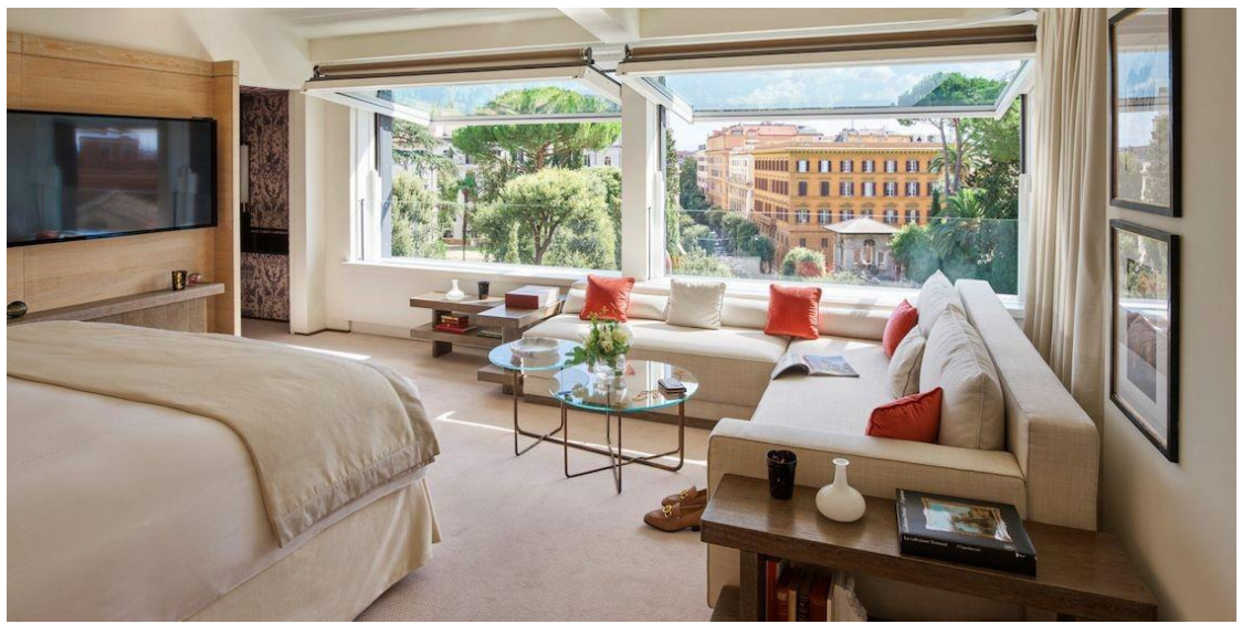
Hotel Eden Bellavista Penthouse Suite

• Rome: Explore the Colosseum and Vatican City with a private guide, followed by an authentic Italian dinner in your penthouse overlooking historic landmarks.