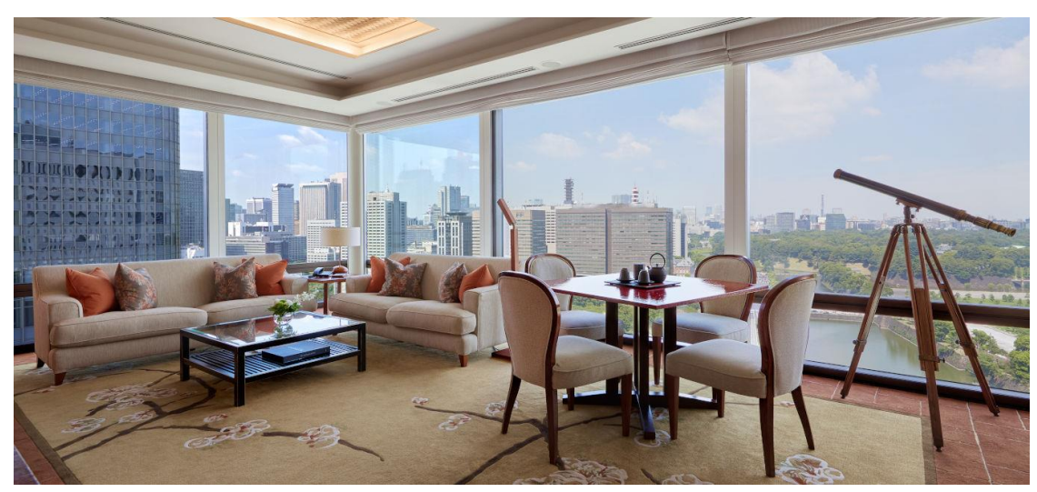
The Peninsula Tokyo Suite

• Shanghai : Visit the historic Bund, explore Yuyuan Garden, and enjoy fine dining in your penthouse with views of the city skyline.