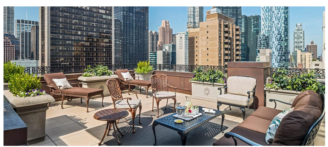
The Plaza Hotel New York Grand Penthouse Two Bedroom Terrace Suite

New York City: Spend a day shopping on Fifth Avenue, followed by a private dinner on your penthouse terrace overlooking Central Park.