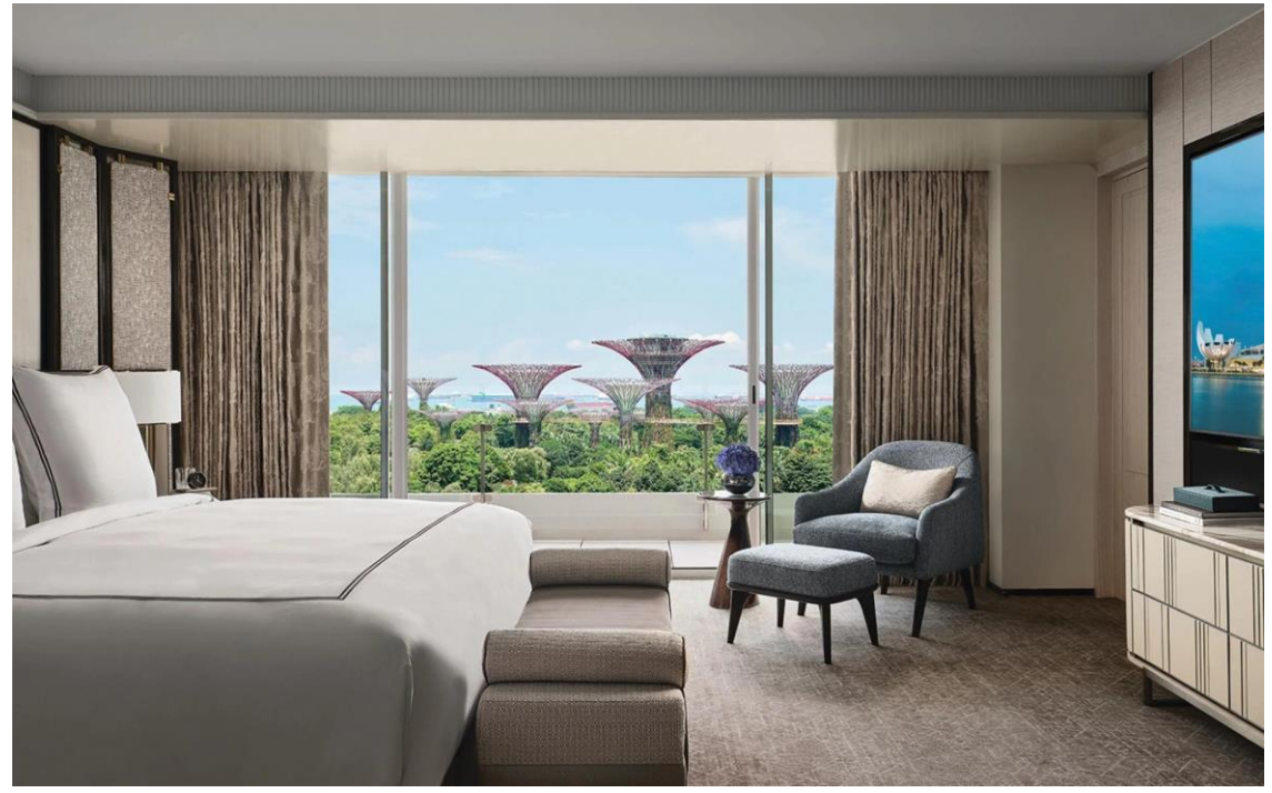
Marina Bay Sands Premier Suite

• Singapore : Explore Gardens by the Bay, enjoy a private cruise along the Marina Bay and dine in your penthouse with views of the city skyline.