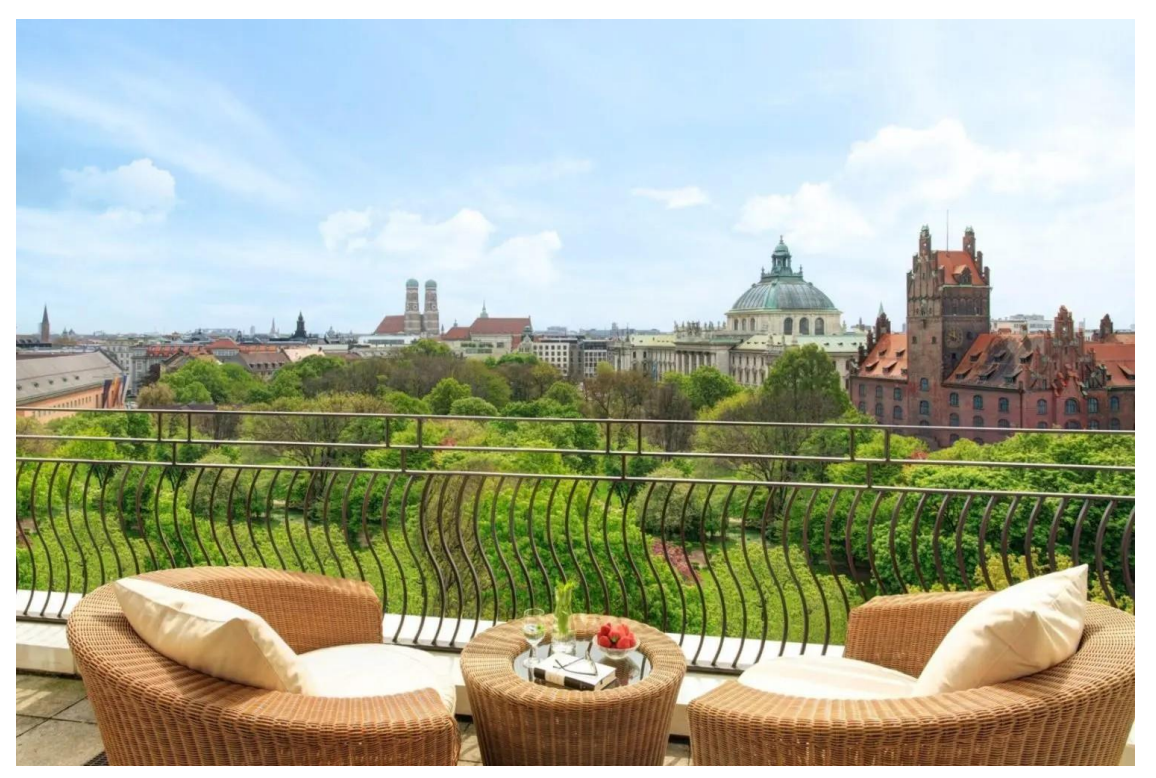
The Charles Hotel Munich Monforte Royal Suite

• Frankfurt : Explore the Römer, visit art galleries and enjoy a luxurious dinner in your penthouse with skyline views.