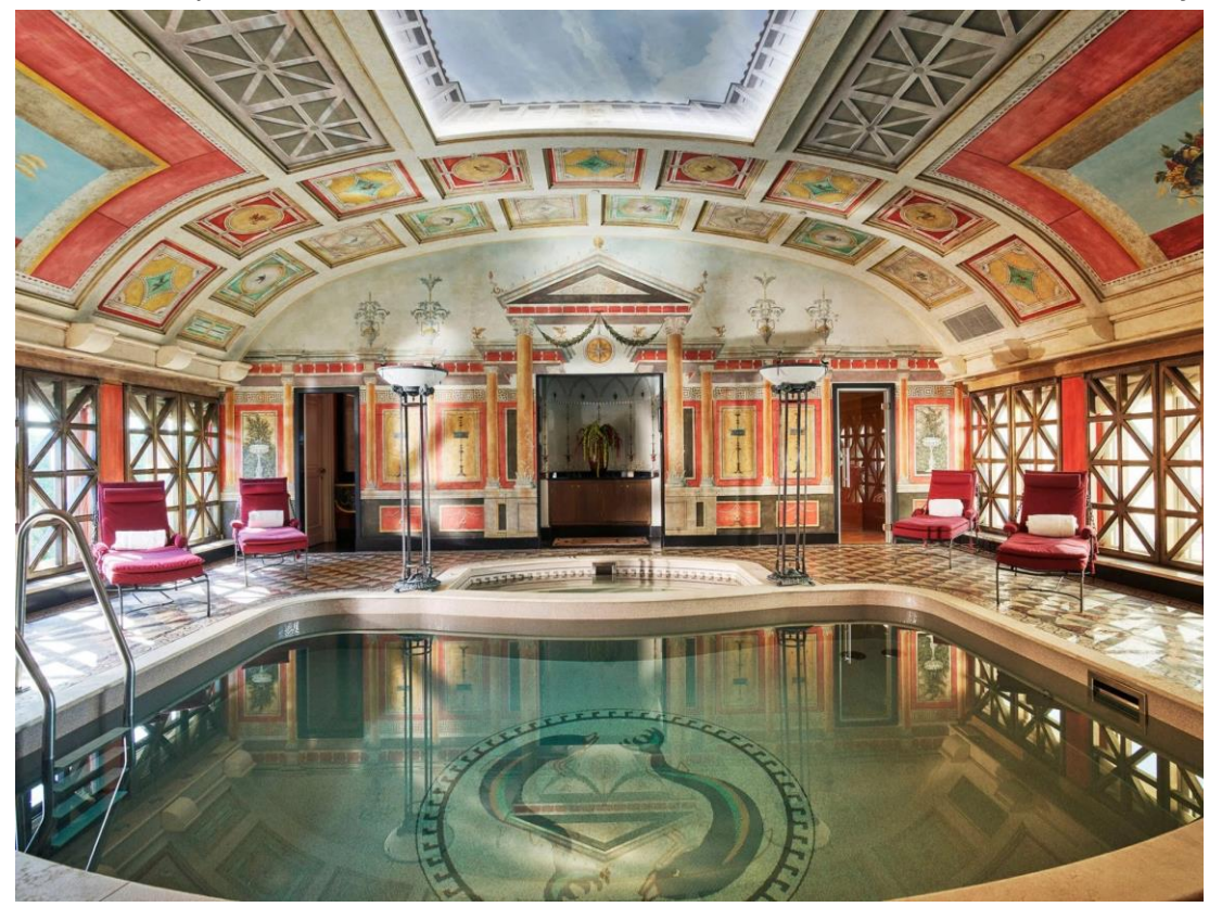
Hotel Principe Di Savoia - Dorchester Collection Presidential Suite

Milan: Visit the stunning Duomo di Milano, enjoy shopping at high-end boutiques and savor a private dinner at a Michelin-starred restaurant with views of the city.