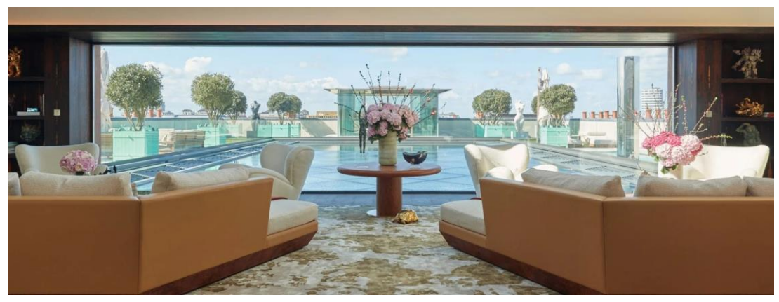
The Penthouse at Claridge's

Paris: Enjoy a private tour of the Louvre, indulge in exclusive shopping on Avenue Montaigne and return to your penthouse for a sunset dinner with breathtaking views of the Eiffel Tower.