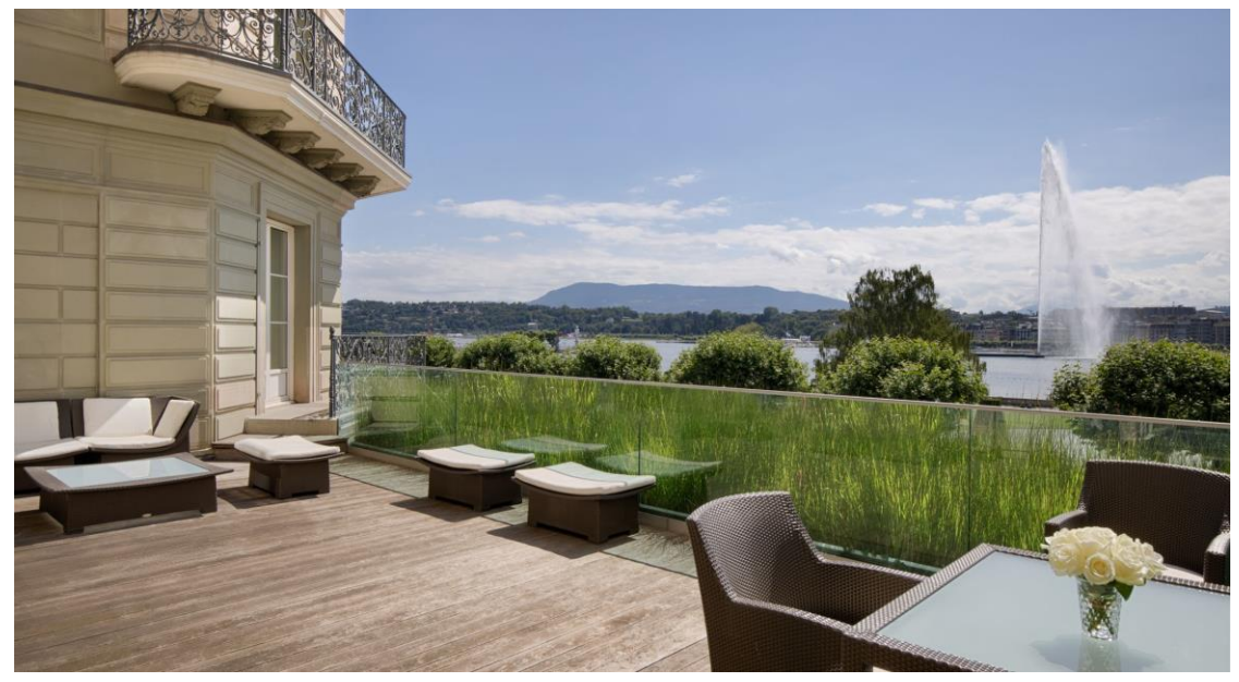
Beau-Rivage Genève Presidential Suite

• Geneva : Take a private boat trip on Lake Geneva, explore the charming old town and enjoy a gourmet dinner in your penthouse with stunning lake views.