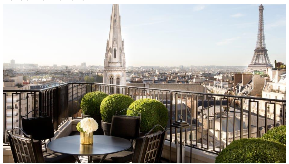
Four Seasons Hotel George V The Penthouse

Paris: Enjoy a private tour of the Louvre, indulge in exclusive shopping on Avenue Montaigne and return to your penthouse for a sunset dinner with breathtaking views of the Eiffel Tower.