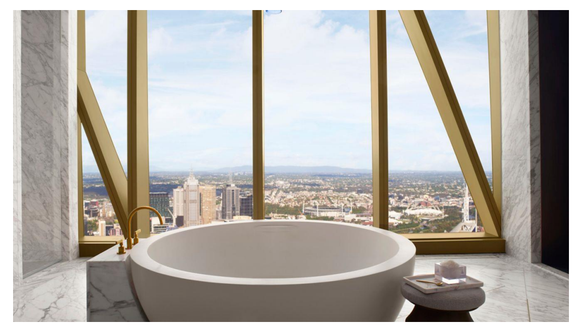
The Ritz-Carlton Suite, Melbourne

• Cape Town: Spend your morning at the breathtaking Table Mountain, followed by a private wine tour in the Cape Winelands and enjoy an exquisite dinner in your penthouse with stunning ocean views.