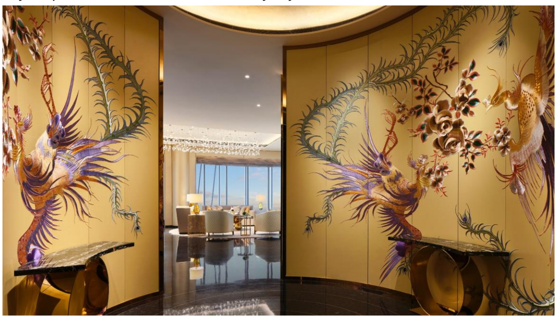
J Hotel, Shanghai Tower Suite

• Shanghai : Visit the historic Bund, explore Yuyuan Garden, and enjoy fine dining in your penthouse with views of the city skyline.