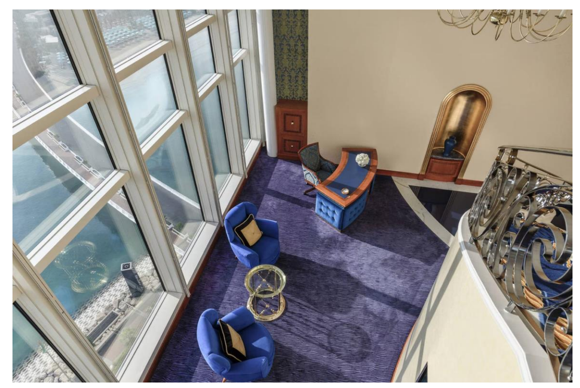
Jumeirah Burj Al Arab Dubai Panoramic One Bedroom Suite

• Singapore : Explore Gardens by the Bay, enjoy a private cruise along the Marina Bay and dine in your penthouse with views of the city skyline.