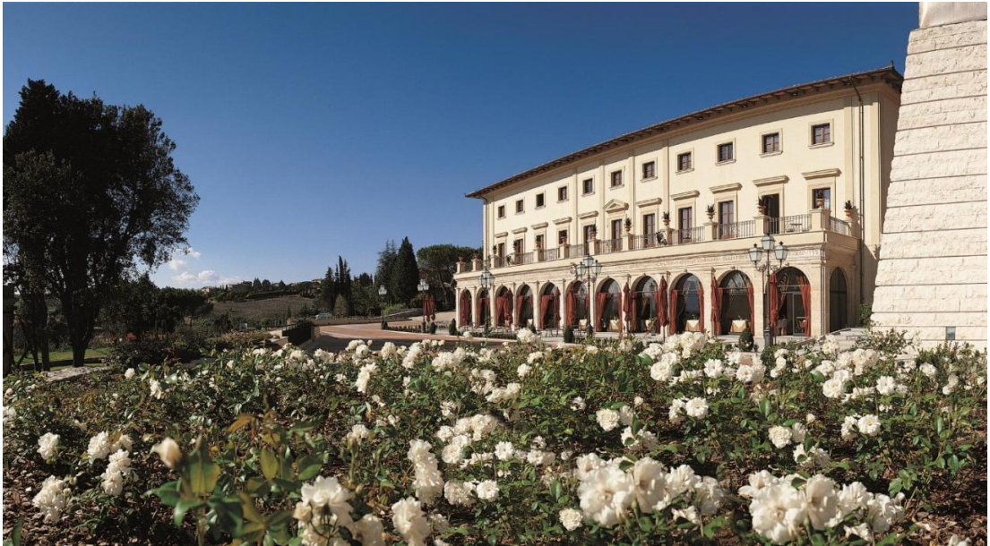
Fonteverde Lifestyle & Thermal Retreat - The Leading Hotels of the World – Tuscany, Italy