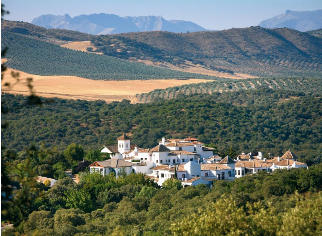
La Bobadilla, a Royal Hideaway Hotel - Andalucía, Spain