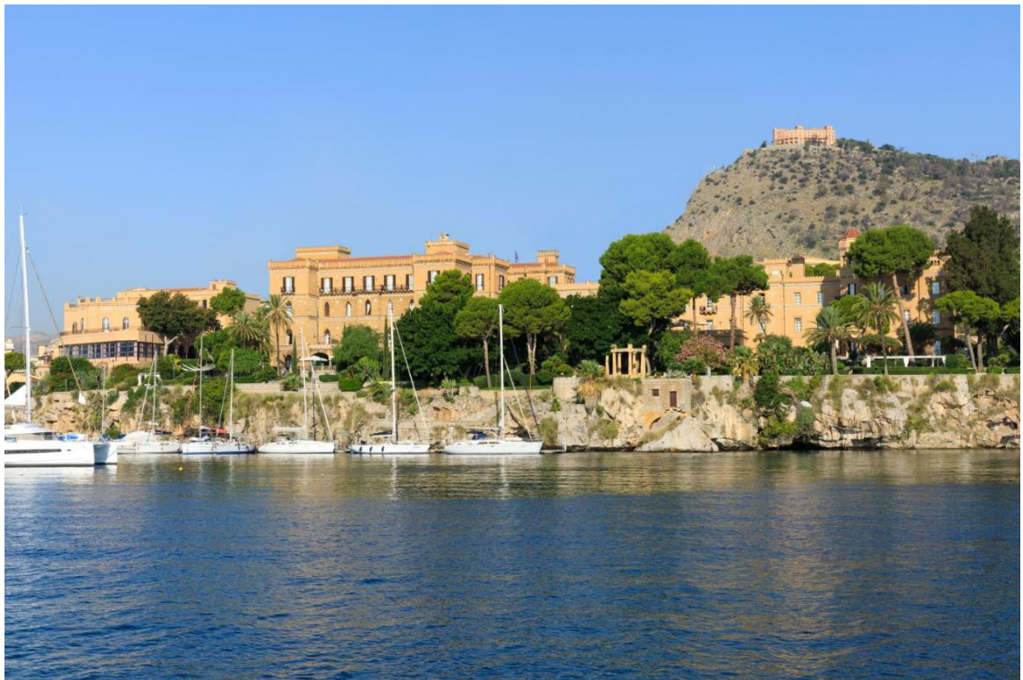
Rocco Forte Villa Igíea - Palermo, Sicily, Italy