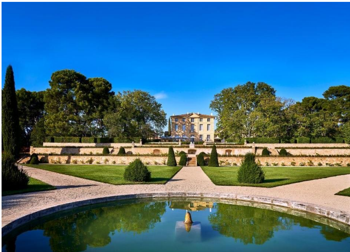
Château de la Gaude - Aix-en-Provence, France