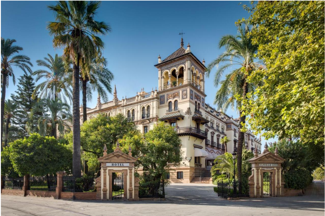
Hotel Alfonso XIII, a Luxury Collection Hotel - Seville, Spain