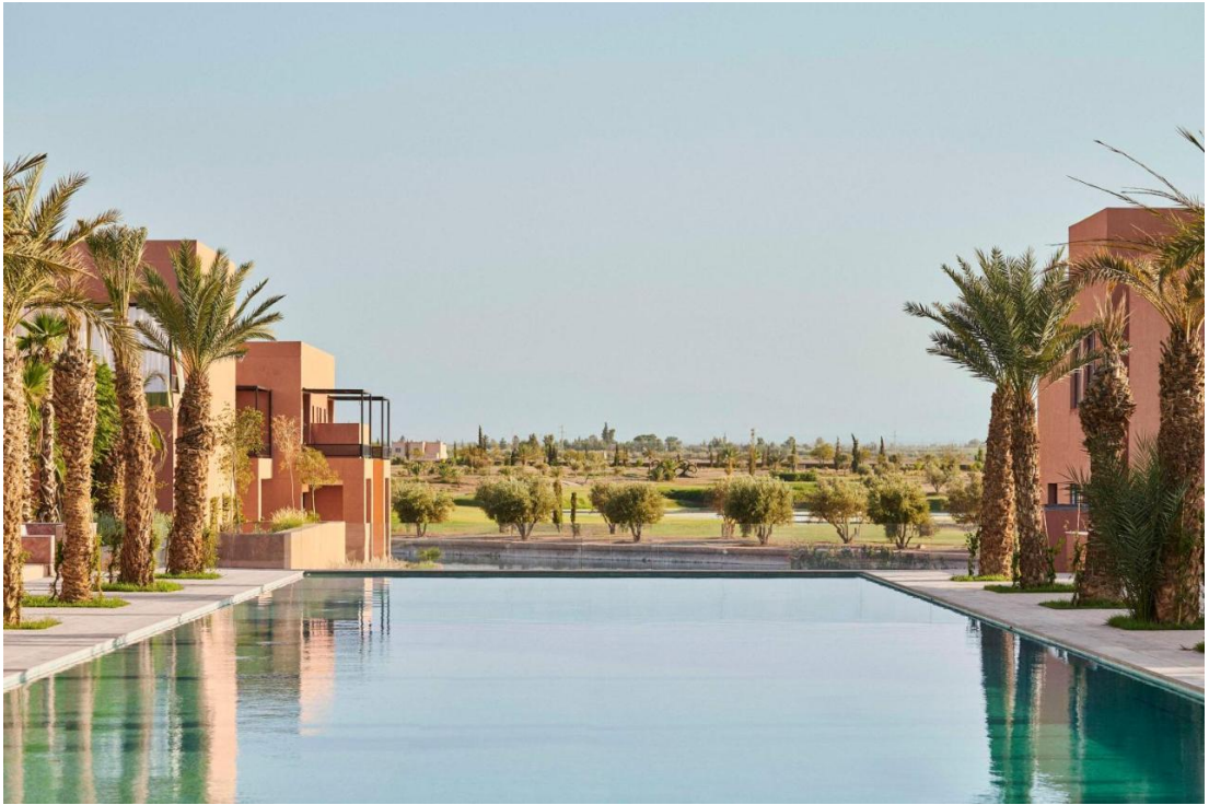
Park Hyatt Marrakech – Morocco