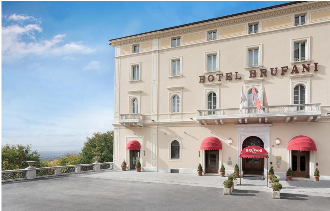
Sina Brufani – Perugia, Umbria, Italy