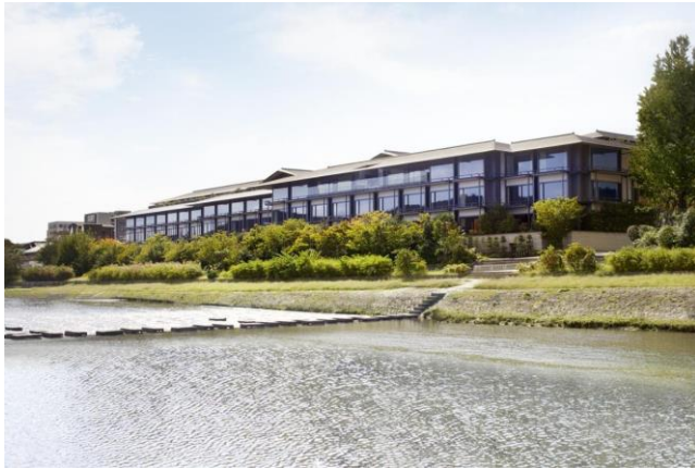
The Ritz-Carlton Kyoto

Spend the Night Choose from luxury ryokans, boutique hotels or exclusive resorts that offer traditional Japanese elegance. In Kyoto, consider The Ritz-Carlton ; in Nara, the luxurious Nara Hotel ; and in the Alps, the exquisite HOTEL WOOD TAKAYAMA .