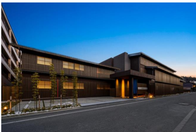
HOTEL WOOD TAKAYAMA