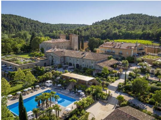
Château de Berne

Spend the Night Stay in chateaux, boutique hotels, or private villas that reflect the character of each location. Consider Château de Berne in Provence or Château de la Gaude or Villa Gallici Hôtel & Spa in Aix-en-Provence for opulent accommodations.