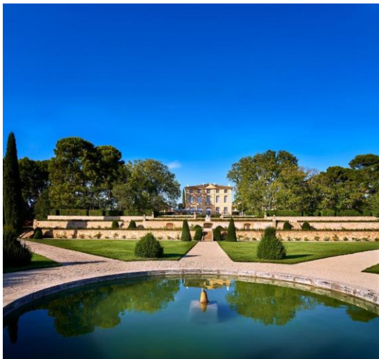
Château de la Gaude