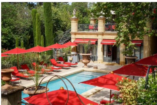
Villa Gallici Hôtel & Spa