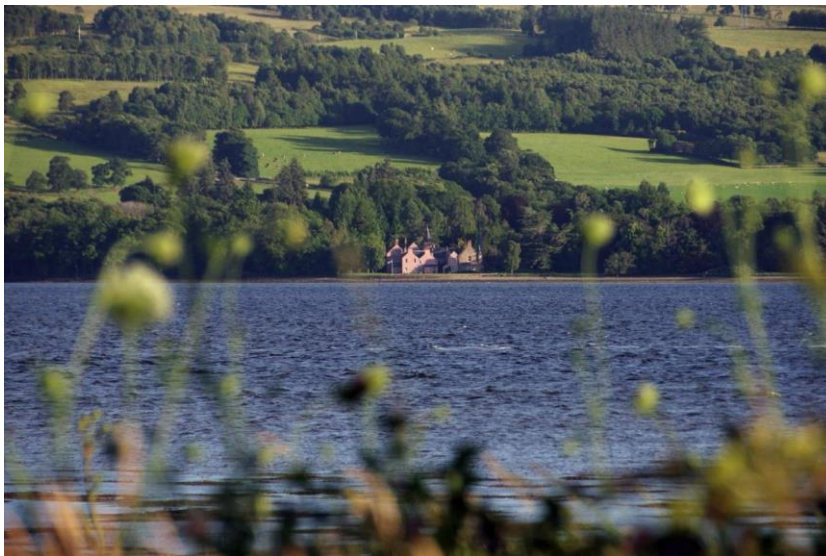
Bunchrew House Hotel