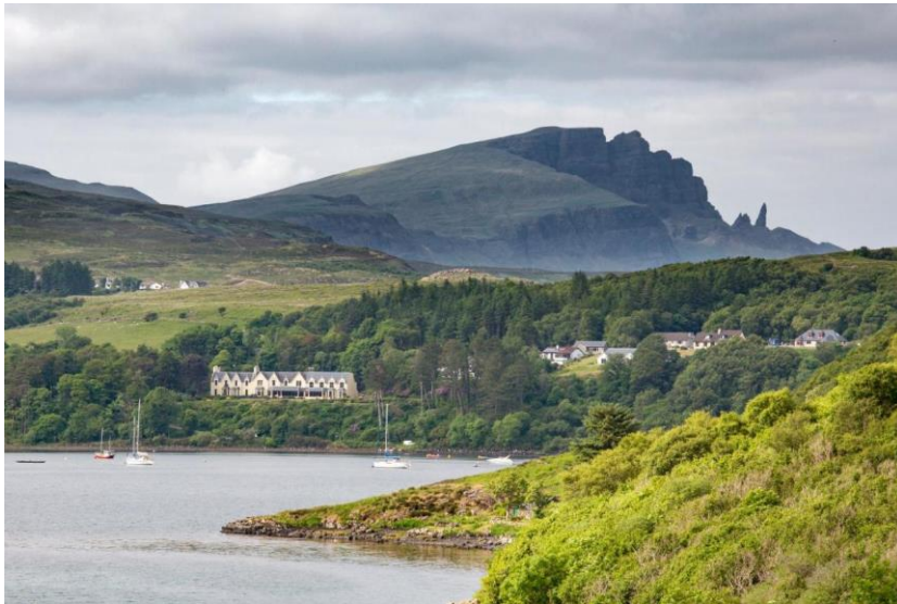
Cuillin Hills Hotel

Spend the Night Opt for historic manors or exclusive lodges that offer Scottish charm with modern luxury. Cuillin Hills Hotel or Bunchrew House Hotel provide distinguished accommodations.