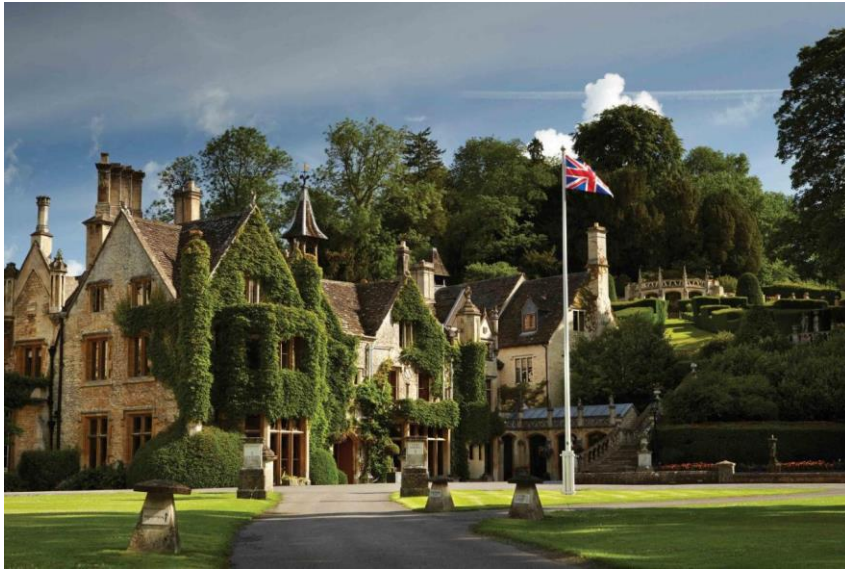
The Manor House Hotel and Golf Club

Spend the Night Stay in luxury country houses, historic manors, or seaside resorts that offer English charm with modern amenities. The Manor House in Castle Combe or The Headland Hotel and Spa provide exclusive accommodations with stunning views.