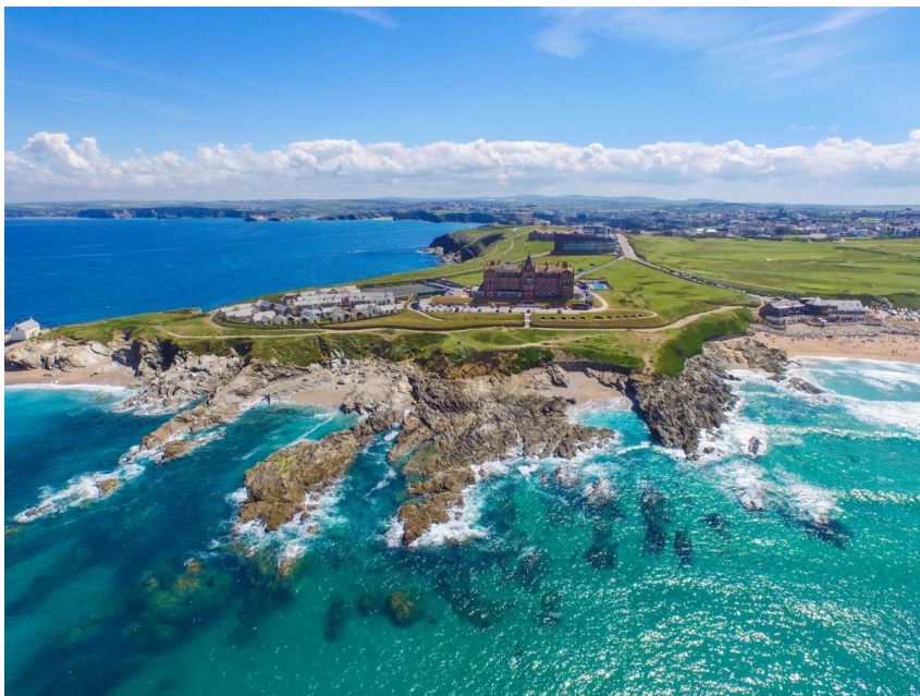
The Headland Hotel and Spa