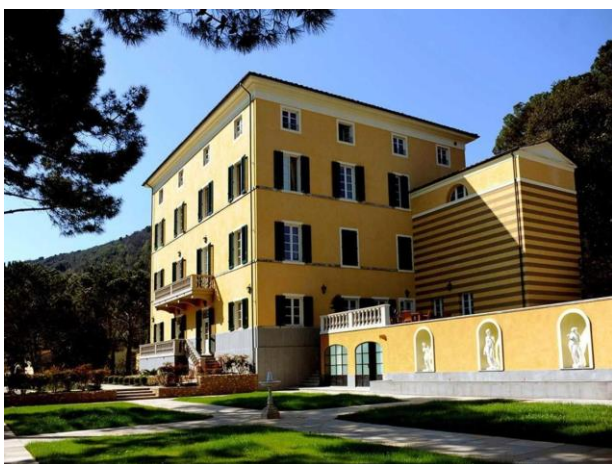
Hotel Villa Casanova