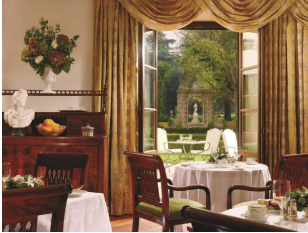
Four Seasons Hotel Firenze

Spend the Night Choose from boutique hotels, historic estates or luxury villas that offer exclusivity and comfort. In Florence, consider staying at the Four Seasons Hotel Firenze ; in Montepulciano, the luxurious Rosewood Castiglion del Bosco ; and in Lucca, the exquisite Hotel Villa Casanova .