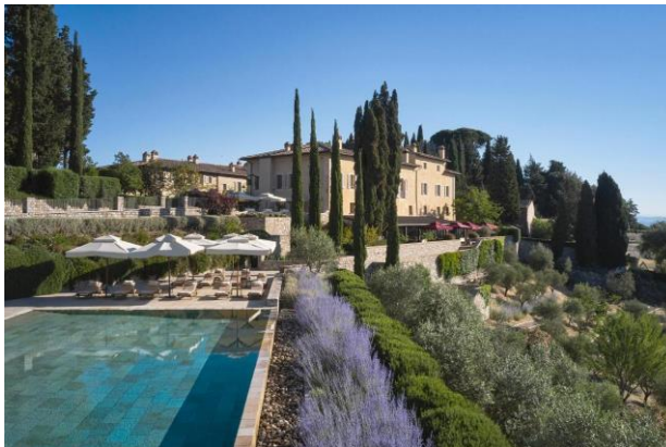
Rosewood Castiglion del Bosco