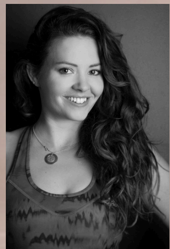
Certificate IV in Performing Arts Certificate III & IV in Fitness Certificate IV in Sport Develop Certificate IV in Athlete Support Acro Arts Module 1 & 2 Certified

While she can teach every style of dance her favourite styles are Hip Hop, Jazz, Acrobatics & Contemporary. Her goal is to inspire the next generation and create unique, personable, and talented individuals.