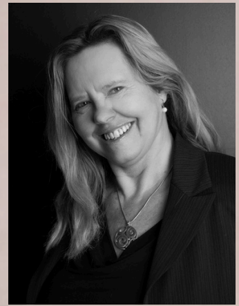
Diploma in Theatrical Dance Acro Arts Module 1 & 2 certified