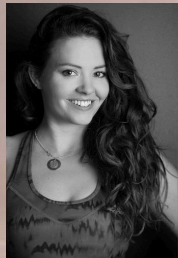
Certificate IV in Performing Arts Certificate III & IV in Fitness Certificate IV in Sport Develop Certificate IV in Athlete Support Certificate IV in Training and Assessing Acro Arts Module 1 & 2 Certified

While she can teach every style of dance her favourite styles are Hip Hop, Jazz, Acrobatics & Contemporary. Her goal is to inspire the next generation and create unique, personable, and talented individuals.