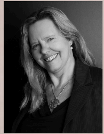
Diploma in Theatrical Dance Acro Arts Module 1 & 2 certified