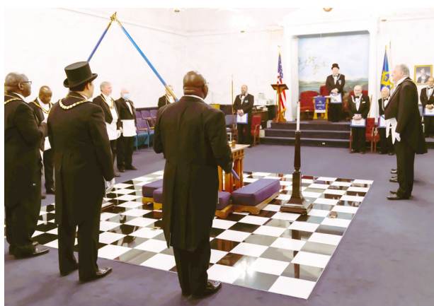
Welcoming the Grand Master