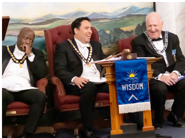
Sharing a Lighter Moment