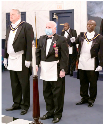
Introducing the PGM's