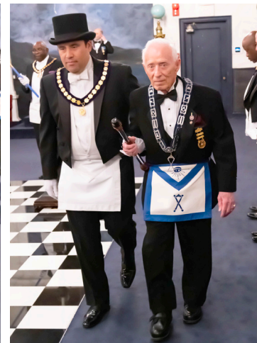
Escorting the GM to the East