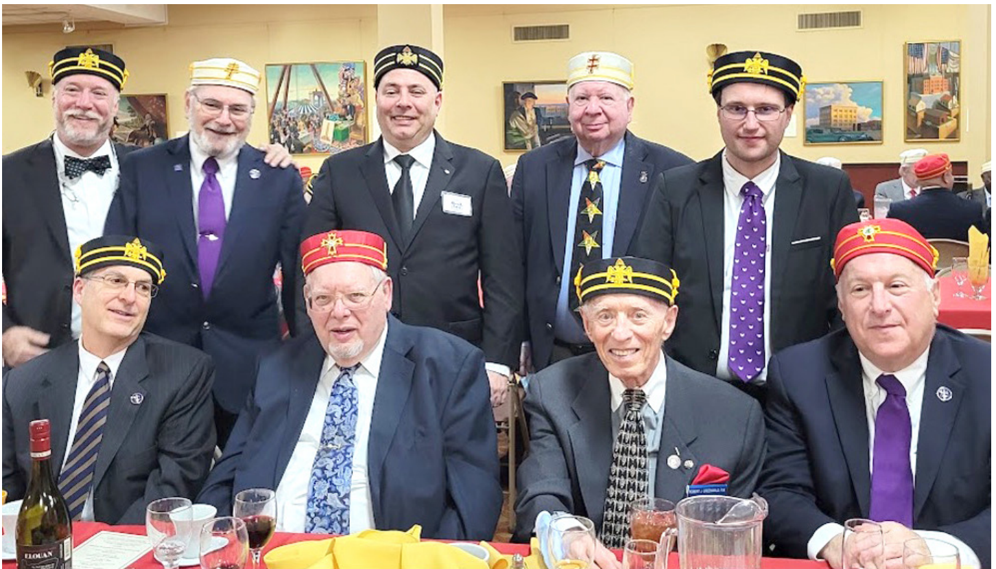
Those who attended this year are pictured above and include:

Members of the ‘Rite’ enjoy unity with the greater Masonic Fraternity and an increased knowledge of Masonry in general. Anyone who would like to inquire about membership in the ‘Rite’ can contact me at: Burt753@rcn.com