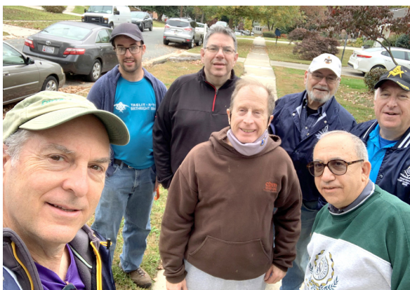
The Deconstruction Crew

Samuel Gompers-Benjamin Franklin Lodge Bulletin