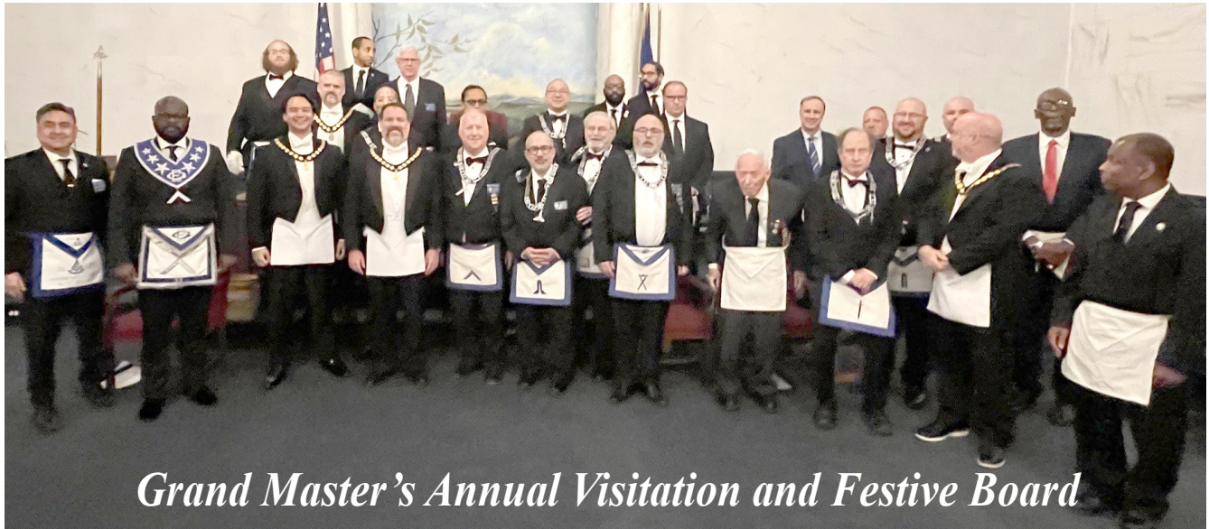
Grand Master's Annual Visitation and Festive Board