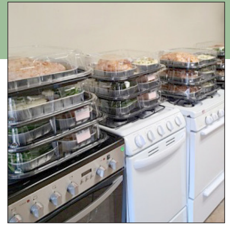
Bro. Keven Stemp loading the Ready Meals Bro. Keven Stemp among the refrigerators Lots and Lots of Ready Meals ready to be delivered