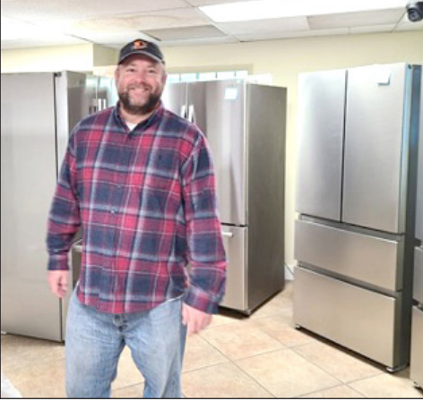
used to store the meals