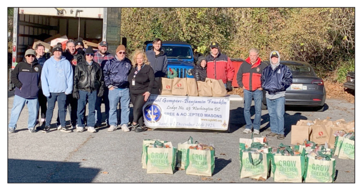
The assembled volunteers