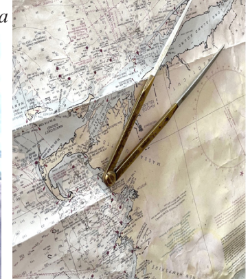
The Captains Compass