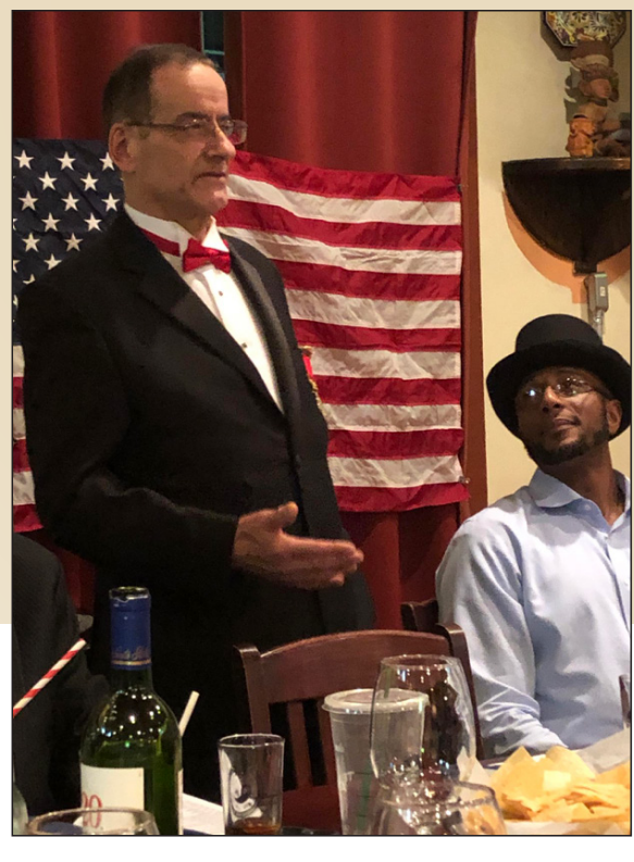
The Grand Master gives a toast at Harmony's Table Lodge