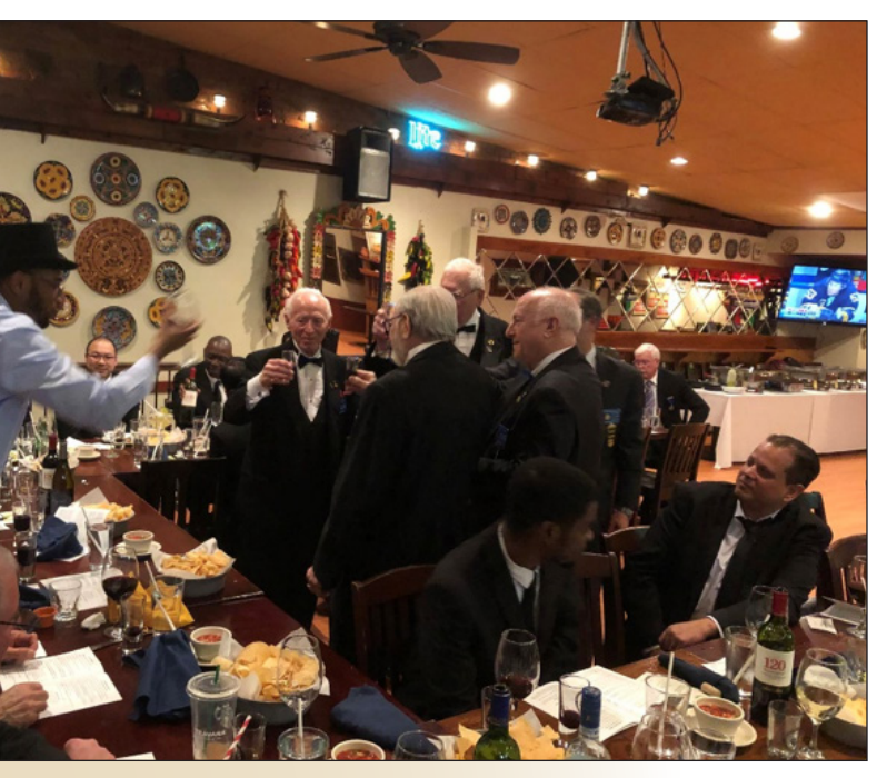
SGBF#45 was well received at Harmony's Table Lodge