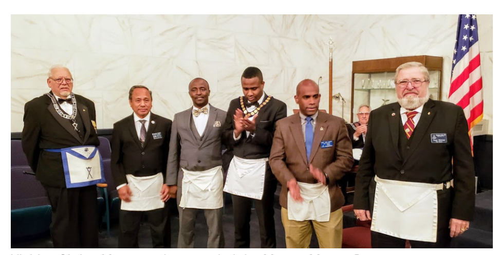
Visiting Sitting Masters who attended the Master Mason Degree