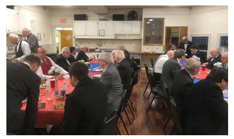
The large crowd that gathered for dinner prior to the Master Mason Degree