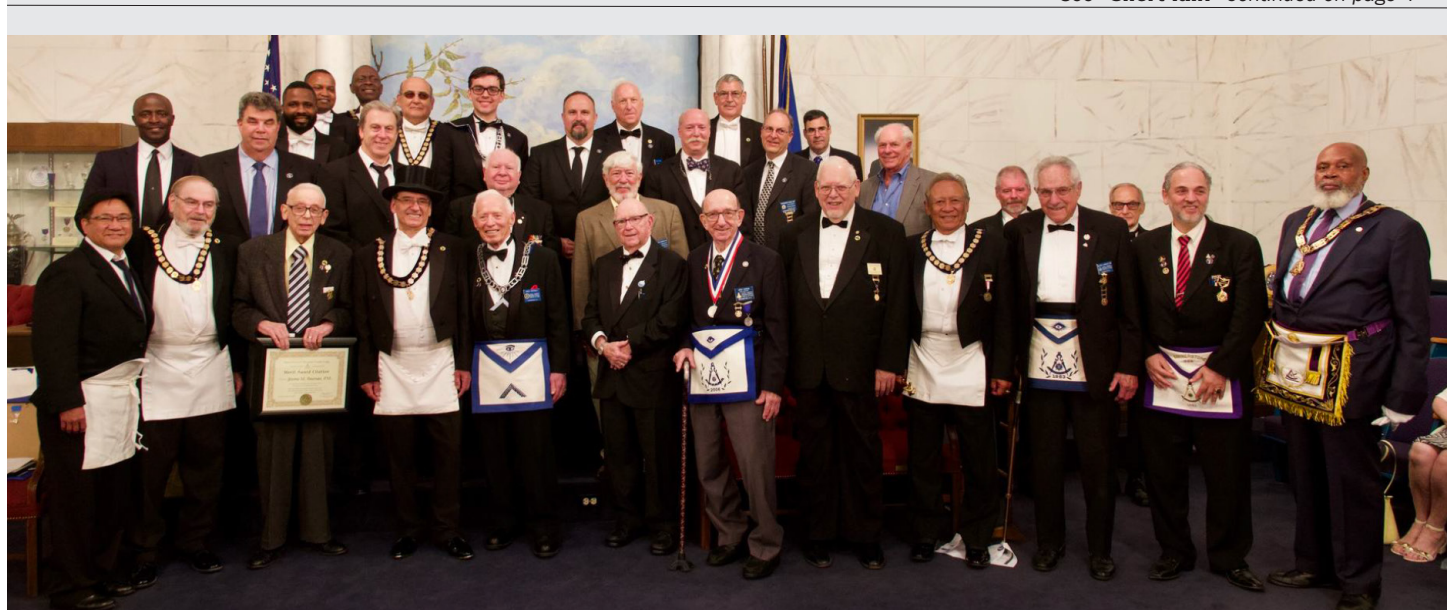
Brethren attending our Grand Visitation who stayed for the awards ceremony.