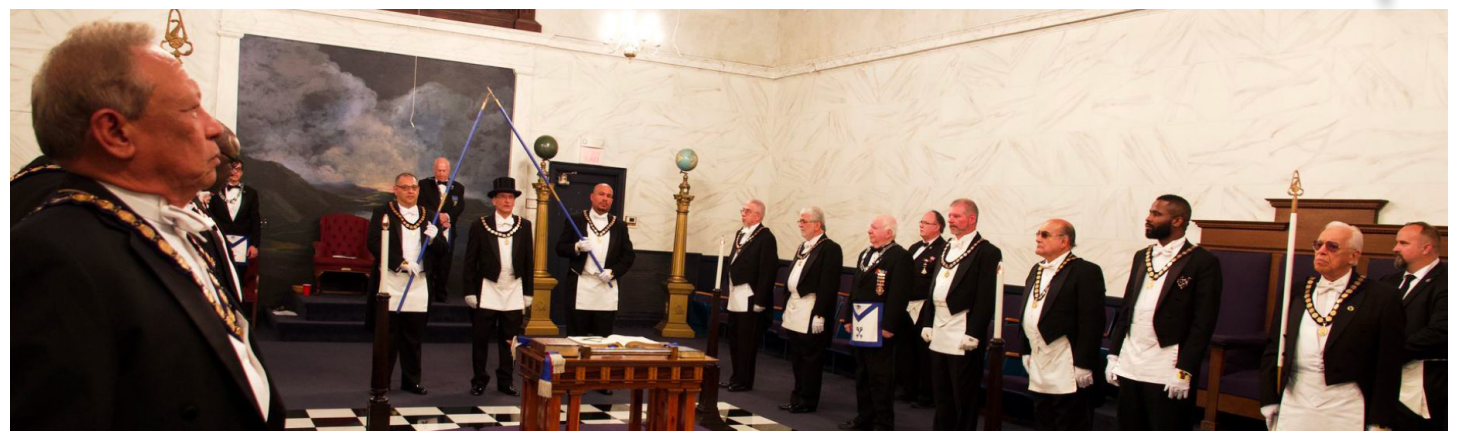
The Grand Master and his Officers assemble for the Grand Visitation