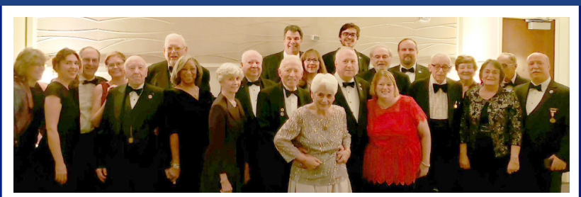
There were a large number of officers and their family at the Grand Lodge Banquet