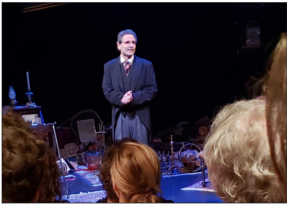
A good crowd attended the Olney Theatre for the one man show, A Christmas Carol