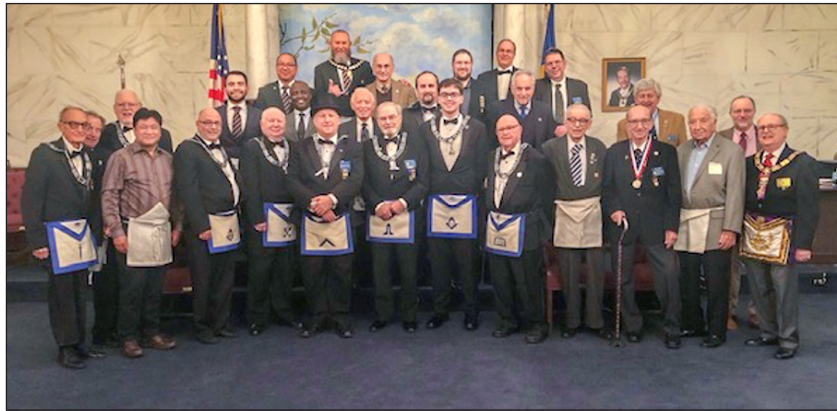
A good turnout for a very cold January meeting