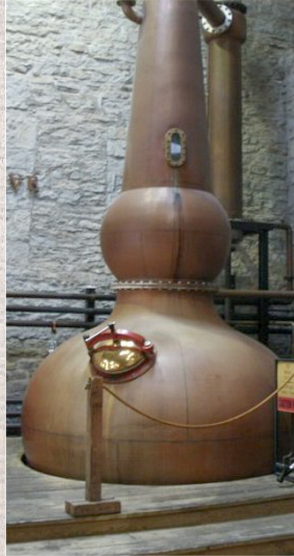
Pot Still, Woodford Reserve

For the tasting, we supplied Lodge shot-glasses which the Brethren kept as a memento of this event. It's best to use actual glass rather than plastic.