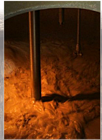
Mash cooker, Woodford Reserve