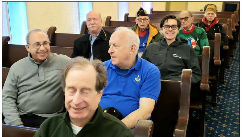
Our Brethren turned out in force for our Christmas Visitation at the VA Hospital