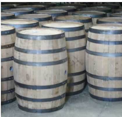
Barrels Waiting to be Filled, Woodford Reserve