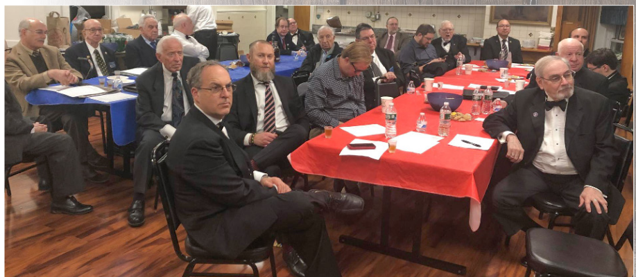
A large turnout and committed attendance stayed for the program.