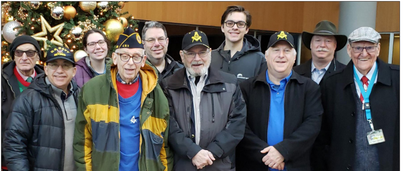
The full crowd from our visitation to the VA Hospital