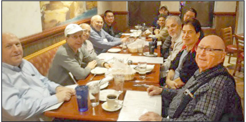
Our first Monthly Meet-Up of the year at Mamma Lucia Italian Restaurant in Olney, Maryland.