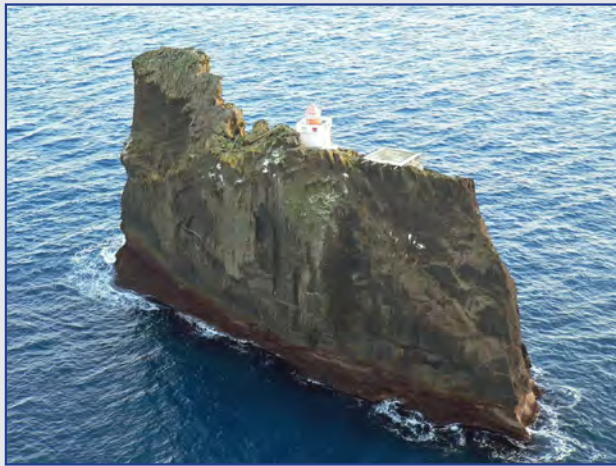
The extremely isolated Thridrangar lighthouse

Searching for our other namesake – Brother Samuel Gompers is an interesting exercise. This Brother dedicated his entire professional career to making life better for American workers. There are tons of material about the work he did. Most of his famous quotes are in relationship to business, unions and their workers. But I found one that seems more appropriate today.