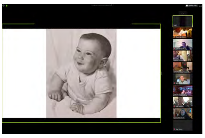
Guess who used to be cute? See the next photo.