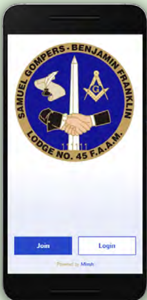
Image of the App opening screen