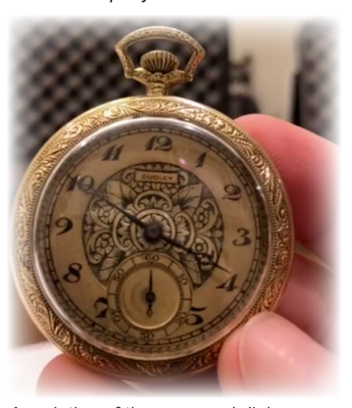
A variation of the engraved dial