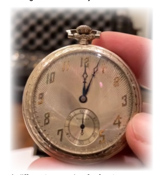
A different example of a front