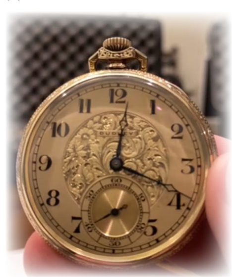
An engraved front dail