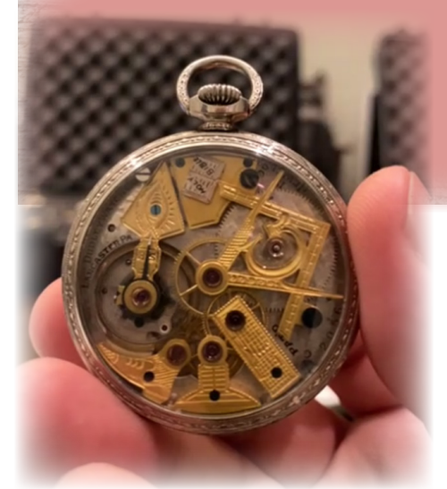
A Model 2 which includes a Bible among the Masonic Symbols