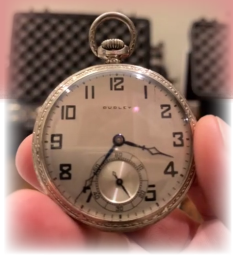
One of several examples of the front dial