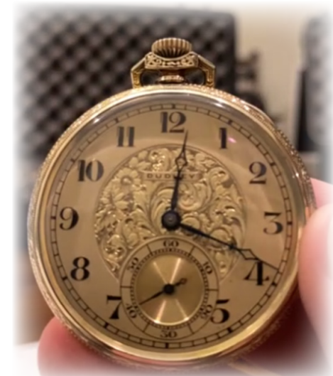
An engraved front dial