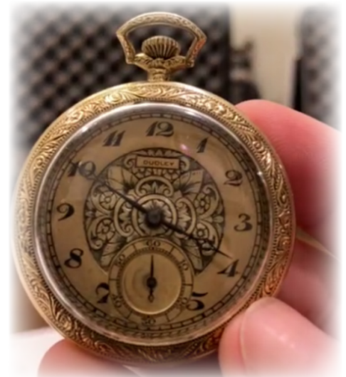
A variation of the engraved dial