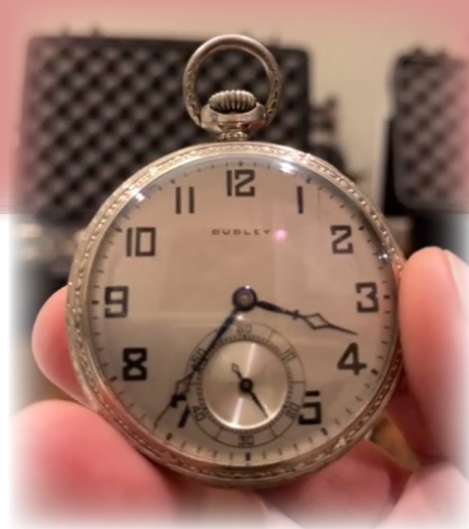
One of several examples of the front dial