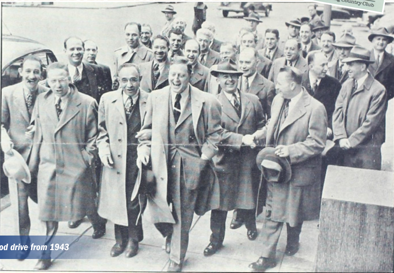
Blood drive from 1943