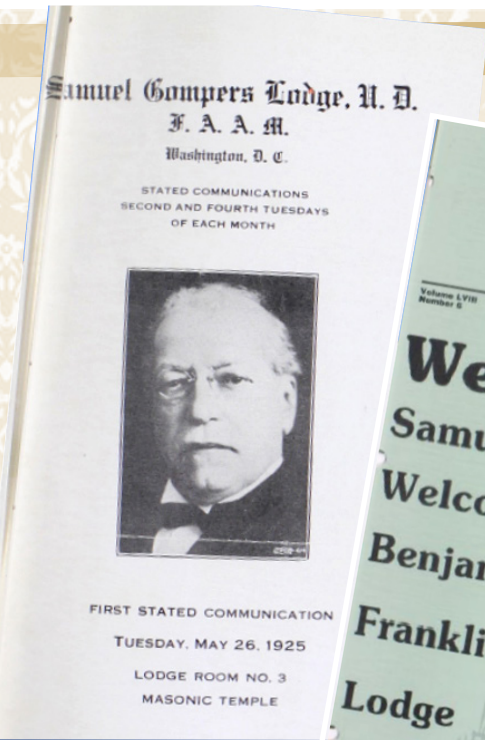
Merger Announcement, Effective June 14, 1983