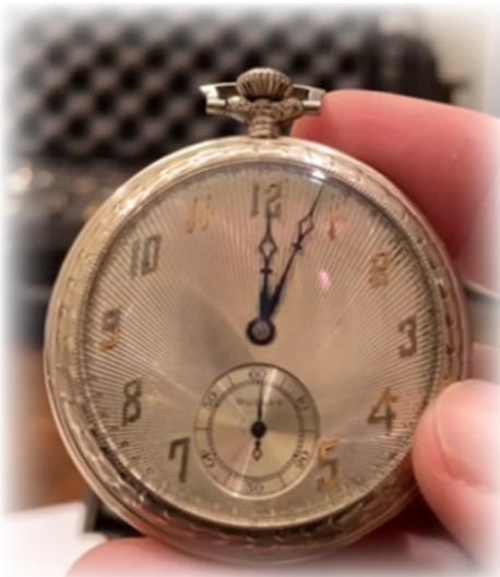
A different example of a front