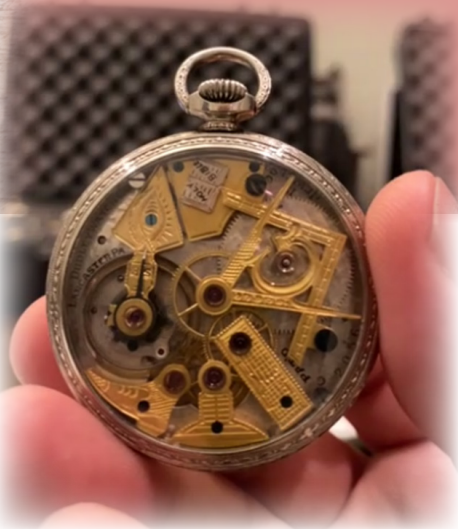
A Model 2 which includes a Bible among the Masonic Symbols

Photographs are of watches presented by RWB Michael Greenwald for our Masonic Antique Road Show.