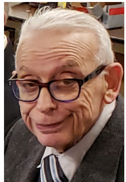
Samuel Gompers-Benjamin Franklin Lodge Bulletin