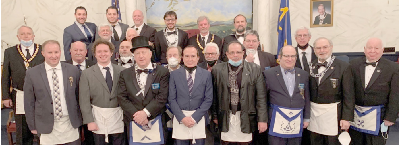
A strong showing for our Master Mason Degree which included two courtesy degrees for Jerusalem Lodge #3000 and two new Master Masons for our Lodge.