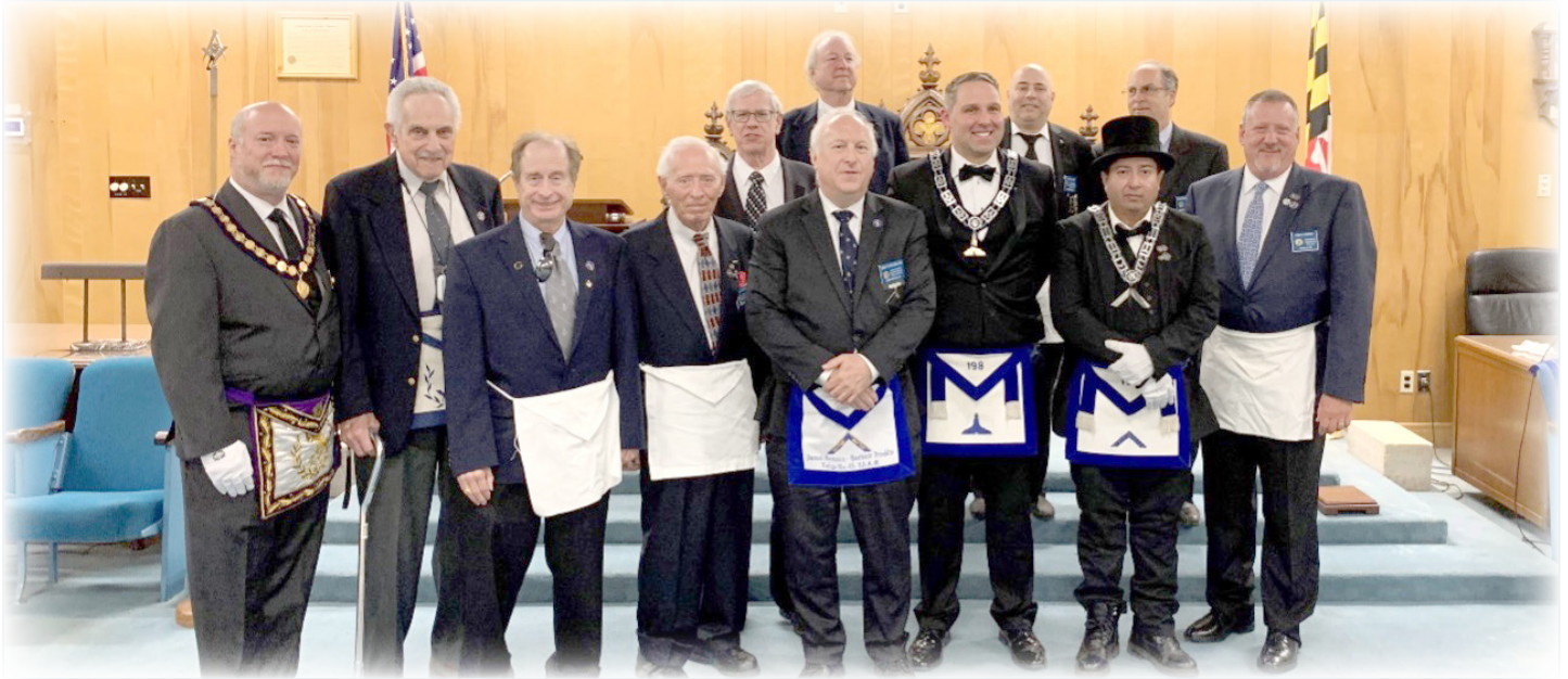
Attending the visitation:

On the night of the usual Stated Communication, the Lodge mixed things up by going to visit Kensington – Bethesda Lodge #198 at a very familiar location. Most Lodge members know this location as our pickup point for the William Boker Thanksgiving Basket Program. A large contingent of our brethren attended to show our appreciation for their hospitality to our Basket Program. The program that night was a Fellow Craft Degree which was preceded by a Maryland proficiency test. Something, many D.C. Masons may not have seen before.