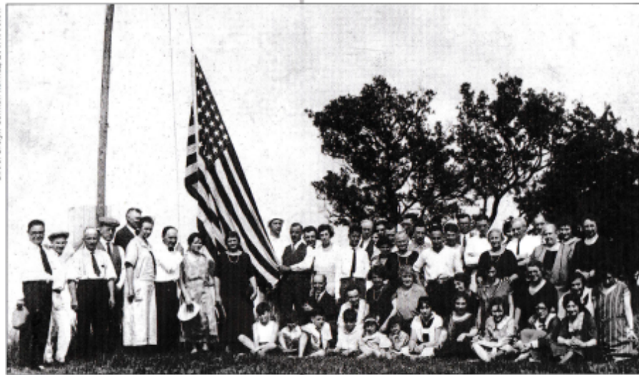
Raising the flag, 1927