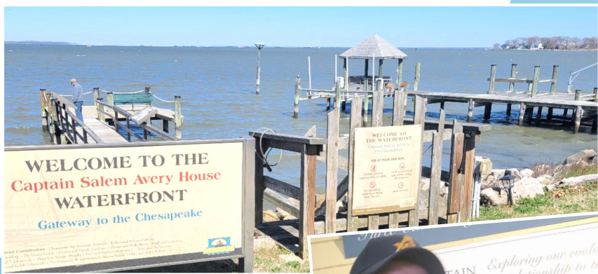
View of the Bay from the Museum