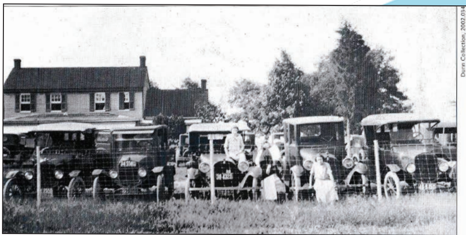
Dunn Collection, 2002.034

The distance to the Club was not just in travel time over primitive roads, but also in cultural difference. When Club families, almost all Jews with recent Eastern European roots, ventured into Shady Side and nearby villages to shop for supplies, dine in restaurants or attend events, they encountered the very different world of southern Maryland: quiet and isolated, oriented to the Bay, with old-fashioned ways and country people. Strongly contrasting with the urban and suburban lives of the Fishing Club families, the rural scene had a folksy appeal. Set apart, removed from their familiar milieu, they experienced a profound relaxation. Largely self-contained at the Club, families found a measure of peace in the isolation and the simplicity of their country retreat.