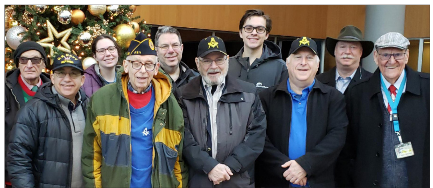
The full crowd from our visitation to the VA Hospital