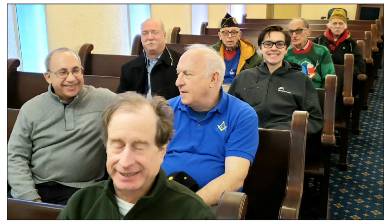
Our Brethren turned out in force for our Christmas Visitation at the VA Hospital