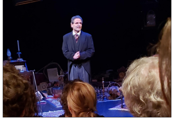
A good crowd attended the Olney Theatre for the one man show, A Christmas Carol