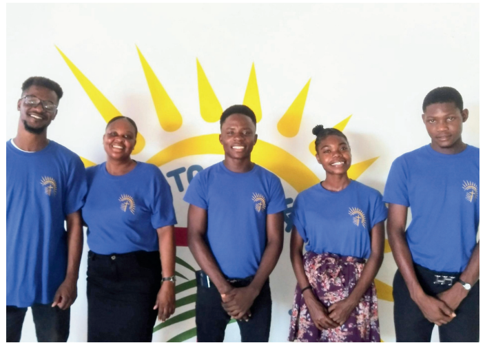
Path to Salvation Church Team