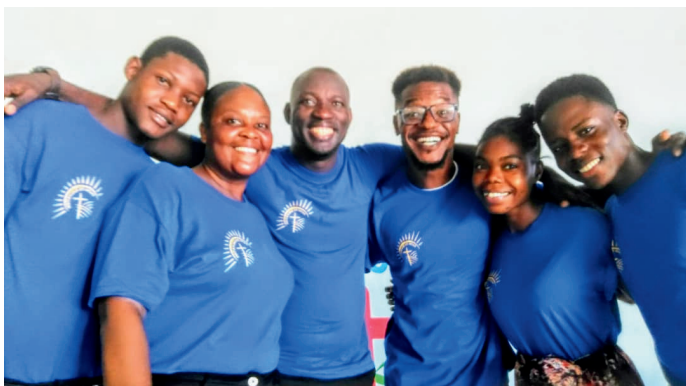
Path to Salvation Church Team

What has it been like living in Titanyen these last couple years? These couple years, living in Titanyen is a negative aspect. But I learn a lot of things also positive too, for example I have learned to trust God. Living in place where without any police and there is anyone that you call in case of needs to go to hospital. You know, I only count on God and my pastor who's always keeping me in touch and support me. I live without no electricity, no good water among the gangsters. So praise be the lord God who keeps me alive because I count on him.