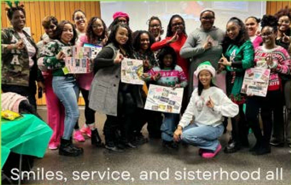
Smiles, service, and sisterhood all in one place