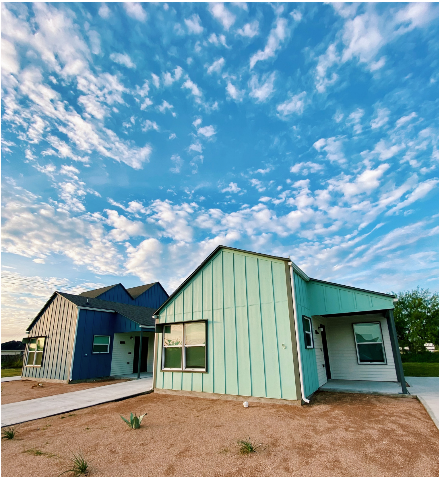
Casitas Lantana in Brownsville