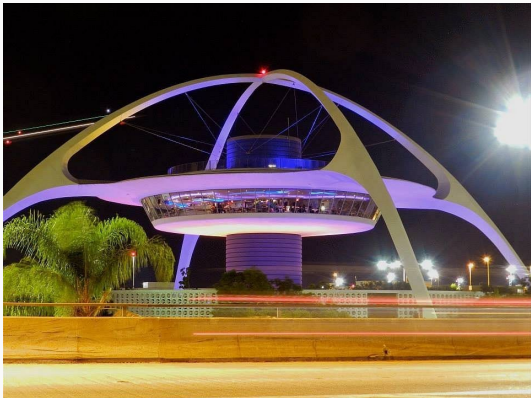
Theme Building at LAX Airport Los Angeles, California (Left)