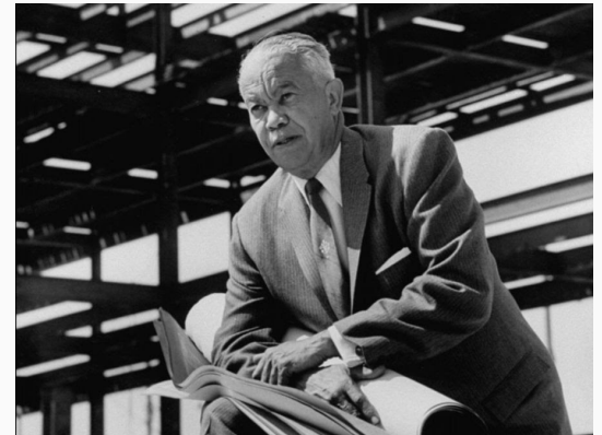
Paul Revere Williams Architect

NAREB- National Association of Real Estate Brokers was founded in 1947. This group of black real estate brokers worked together to advocate for housing and real estate interest for black and minority communities. The Consolidated Board of Realtists formed in 1949 as the Los Angeles board for NAREB.