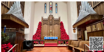
Poinsettia Orders Due by Dec. 7th!