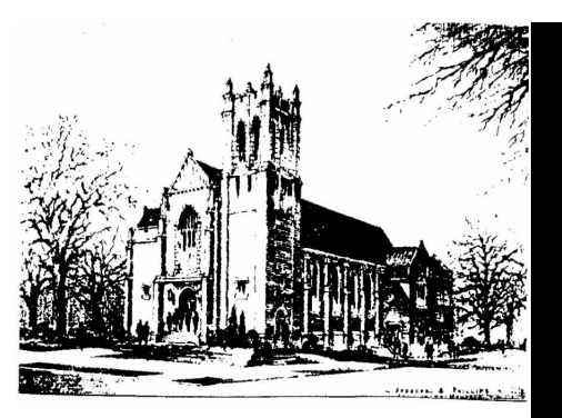
104 Union Street South Concord, North Carolina 28025

Office Phone: 704.786.0166 Website: www.sjnc.net