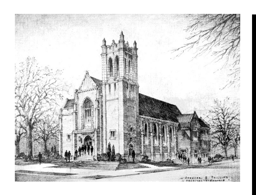
104 Union Street South Concord, North Carolina 28025

Office Phone: 704.786.0166 Website: www.sjnc.net